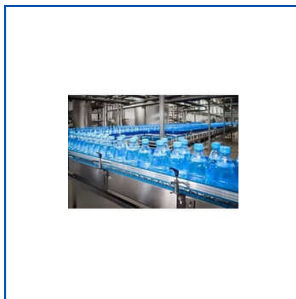
50 BPM MINERAL WATER BOTTLING PLANT