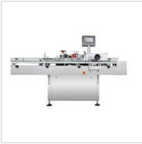
70 BPM Sticker Labeling Machine