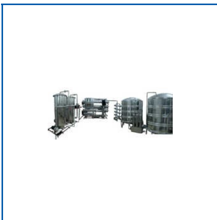
200 BPM MINERAL WATER BOTTLING PLANT

0.5 HP Liquid Filling Machine, 1.5 HP Liquid Filling Machine, 100 BPM BOPP Labeling Machine, 100 BPM Mineral Water Bottling Plant, 1000 BPH PET Blowing Machine, 1000 LPH CSD Filling Machine, 1000 LPH Water Plant Machinery, 1500 LPH CSD Filling Machine, 200 BPM Mineral Water Bottling Plant, 2000 BPH PET Blowing Machine, 2000 LPH Carbonated Soft Drink Plant, 240 BPM Packaged Drinking Water Plant, 30 BPM Mineral Water Bottling Plant, 5 HP Juice Filling Machine, 5 HP Shrink Wrapping Machine, etc.