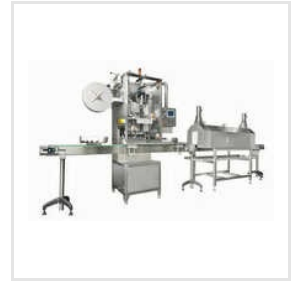
80 BPM Shrink Sleeve Labeling Machine