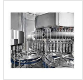
1500 LPH CSD Filling Machine