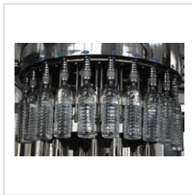
30 BPM Mineral Water Bottling Plant