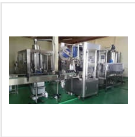
100 BPM Mineral Water Bottling Plant