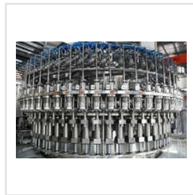
1000 LPH CSD Filling Machine