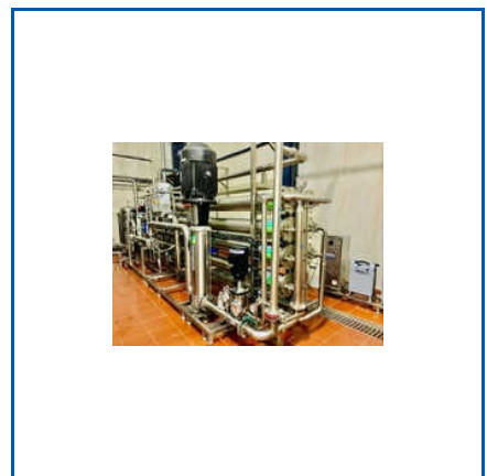
90 BPM MINERAL WATER BOTTLING PLANT