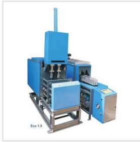
2000 BPH PET Blowing Machine