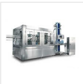
1000 LPH Water Plant Machinery