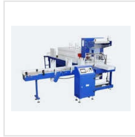
5 HP Shrink Wrapping Machine