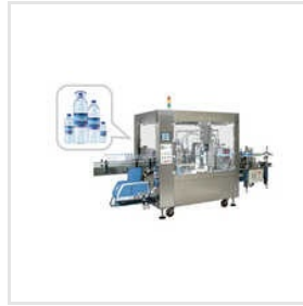
100 BPM BOPP Labeling Machine