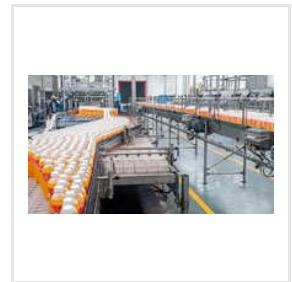
5000 LPH CSD Filling Machine