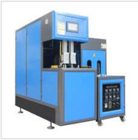
1000 BPH PET Blowing Machine