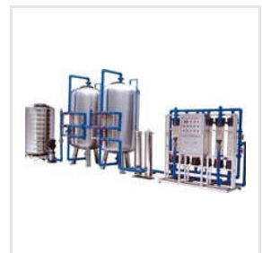
Mineral Water Plant