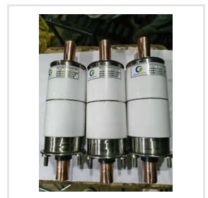
34599C1 Vacuum Interrupter