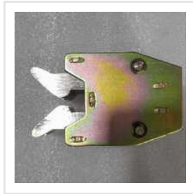
250Amps VCB Jaw Contact