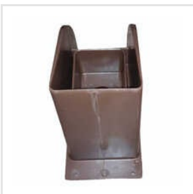
33KV Panel Spout