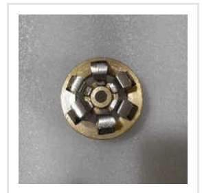
800Amps VCB Jaw Contact