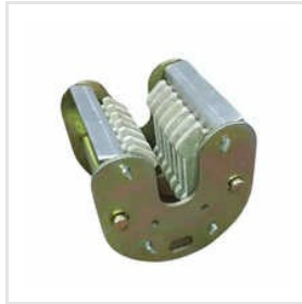
630A ACB Jaw Contacts