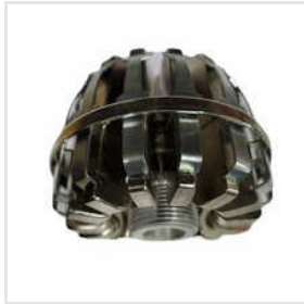
630Amps V Max Jaw Contact