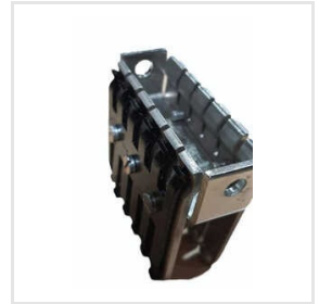
1000Amps VCB Jaw Contact