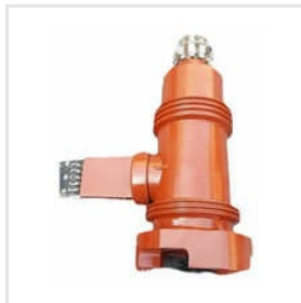
11 KV VCB Panel Spout