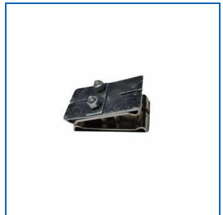
600AMPS VCB JAW CONTACT