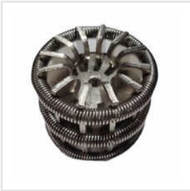
450Amps VCB Jaw Contact