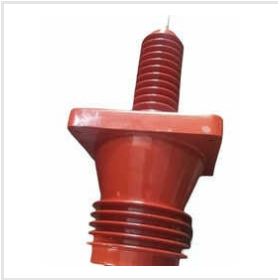
33 KV SF6 Panel Spout