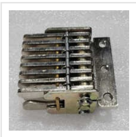
400Amps VCB Jaw Contact