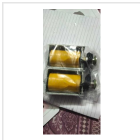
Crompton 110 Volt Tripping Coil For 33 KV