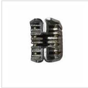
750Amps Four Pole VCB Jaw Contact