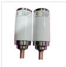
VG2 Vacuum Interrupter Make