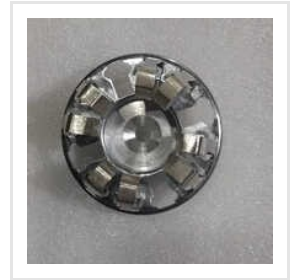
1200 Amp VCB Jaw Contact