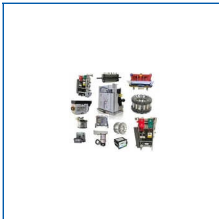
VCB PANEL SPARES FOR CIRCUIT BREAKER

1000Amps VCB Jaw Contact, 11 KV VCB Panel Spout, 11 kv Tripping Coil, 11 kv VCB panel services, 11KV Vacuum Interrupters, 1200 Amp VCB Jaw Contact, 1250Amps GC Jaw Contact, 1250Amps VCB Jaw Contact, 230 V Spring Charging Motor, 250Amps VCB Jaw Contact, 33 KV SF6 Panel Spout, 33 Kv VCB panel Services, 33KV Panel Spout, 33KV Red Vacuum Interrupters, 34599C1 Vacuum Interrupter, etc.