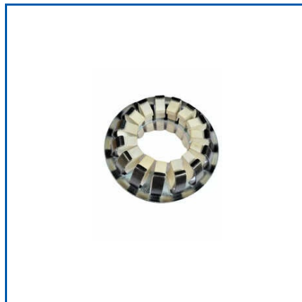
1250AMPS VCB JAW CONTACT