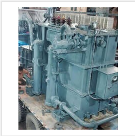
Furnace Duty Transformer