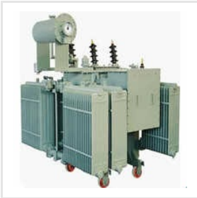
2 MVA Solar Inverter Duty Transformer