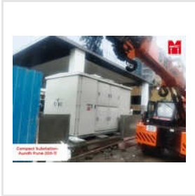
630KVA Compact Secondary Substation