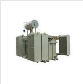
Three Phase Solar Inverter Duty