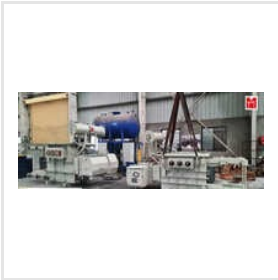
5Mva 3 Phase Oil Cooled Power