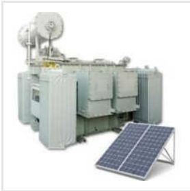
1 Mva Solar Transformer