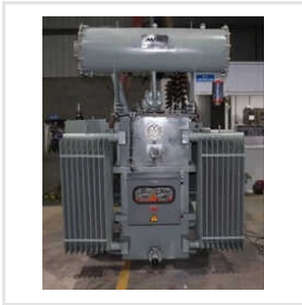
Station Auxiliary Transformer