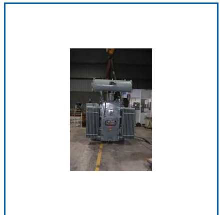
STEP DOWN TRANSFORMER