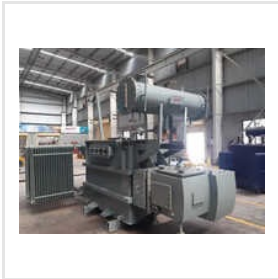
Solar Power Transformers