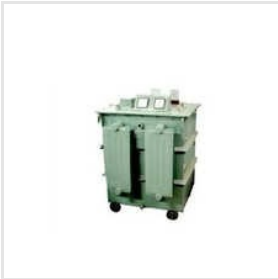
Three Phase Furnace Transformer