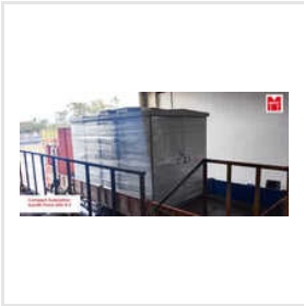
2500 Mva 3 Phase Compact Sub Station