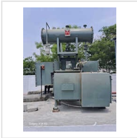
5000KVA Power Transformer