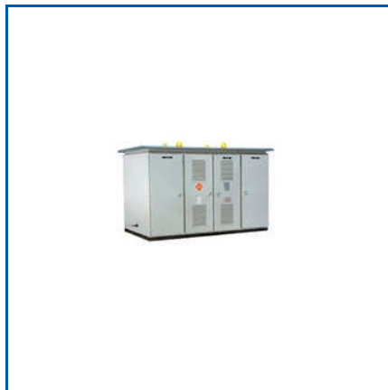
COMPACT SUBSTATION TRANSFORMER