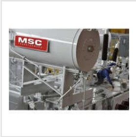
630KVA Three Phase Distribution