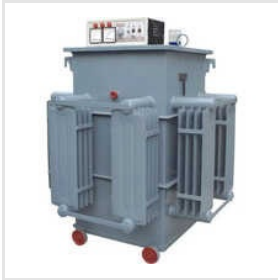
Special Duty Transformers