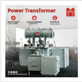
Ester Oil Filled Transformer