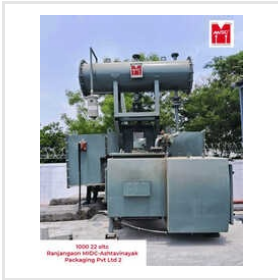
630KVA OLTC Distribution