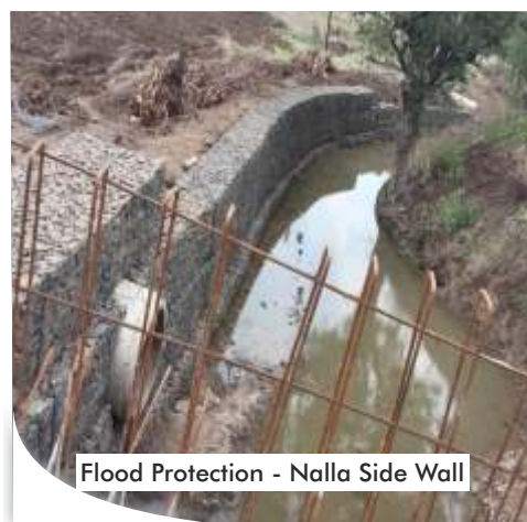
Flood Protection - Nalla Side Wall