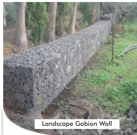
Landscape Gabion Wall