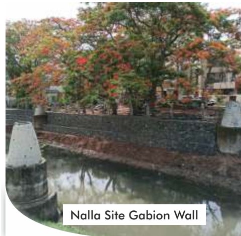
Nalla Site Gabion Wall