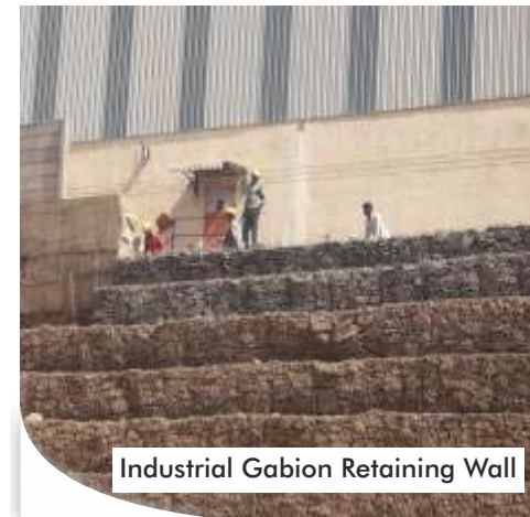
Industrial Gabion Retaining Wall