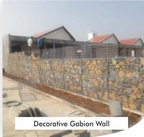
Decorative Gabion Wall