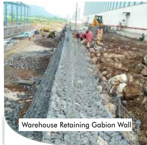
Warehouse Retaining Gabion Wall