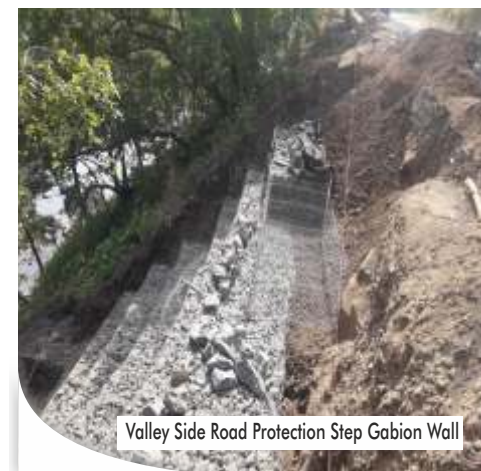
Valley Side Road Protection Step Gabion Wall