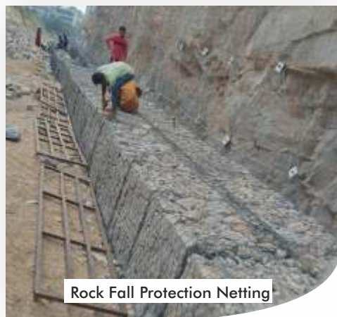
Rock Fall Protection Netting