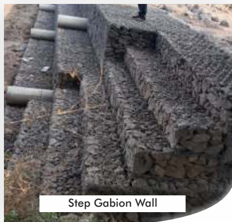
Step Gabion Wall