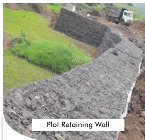
Plot Retaining Wall