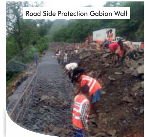
Road Side Protection Gabion Wall