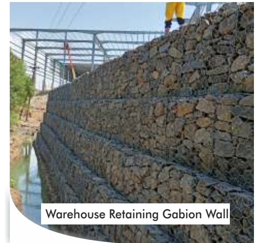
Warehouse Retaining Gabion Wall