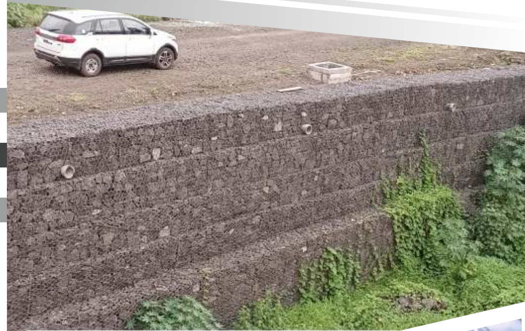
Gabion Retaining Wall