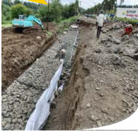
Railway Track Side Protection Gabion Wall