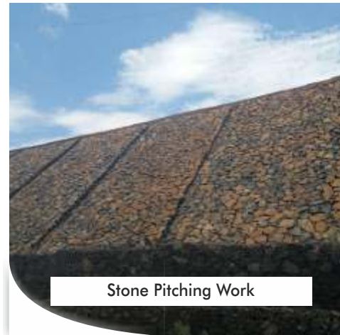
Stone Pitching Work