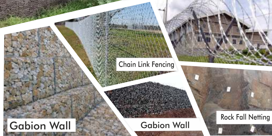
Chain Link Fencing