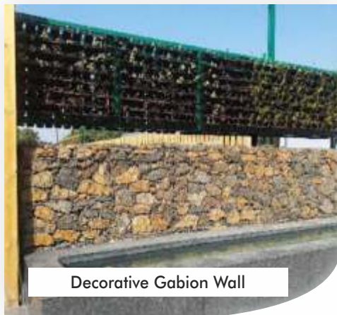
Decorative Gabion Wall