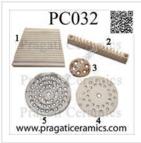
Special Refractories 2