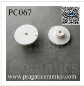
Ceramic Collar Bush