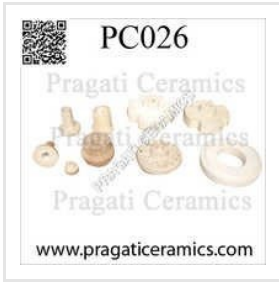
Electrical Ceramic Parts