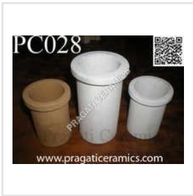
Gold Melting Crucible