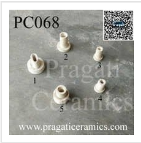
Collar Bush For Furnace