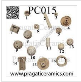
Ceramic Terminal Block Connectors