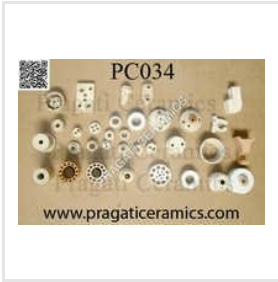
Ceramic Connector Plugs