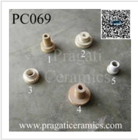
Ceramic Collar Bush