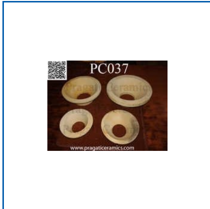
CERAMIC CUP FOR FOUNDRY