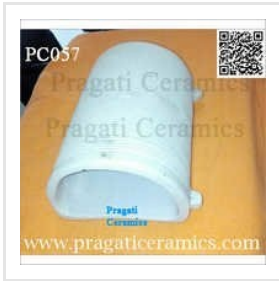
Half Round Muffle