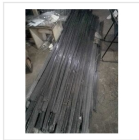
MS HB Straight Cutting (Bright Bar)