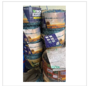
Tata Barbed Wire