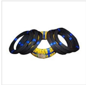
TATA Binding Wire