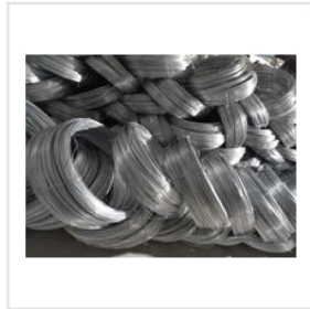
GI Wire (6 Gauge To 20 Gauge)