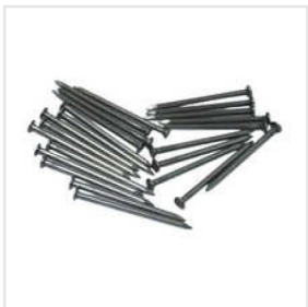
MS Wire Nails (8 Gauge To 14 Gauge)