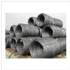
MS Wire Rod