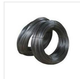
MS High Carbon Wire