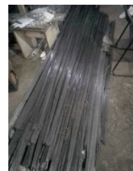
MS HB STRAIGHT CUTTING (BRIGHT BAR)