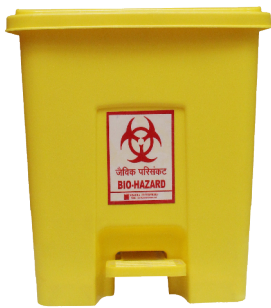
NE-24 32 litre