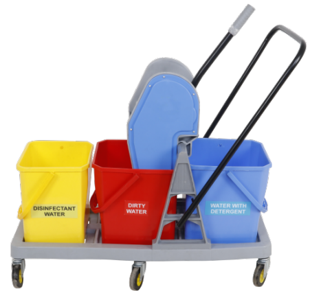
NE-35 (Capacity 48 Ltr., 60 Ltr. & 75 Ltr.)