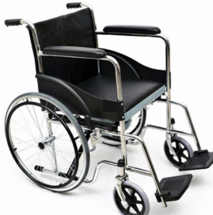
NE-710/Wheel Chair Fixed Seat