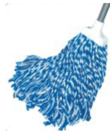
Cup Mop Refill NE00610