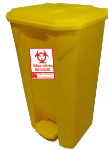
NE-236 90 litre