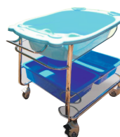
Baby Receiving Trolley