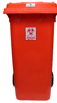
NE-211 120 litre