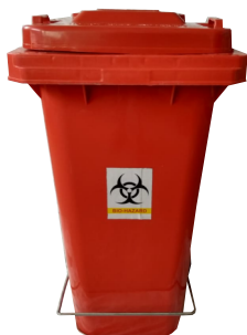
NE-29 120 litre FF