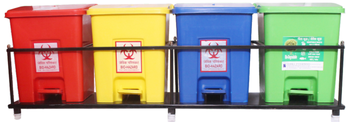
NE-512 MS 4 Bin set 20 litre