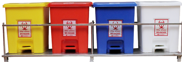
NE-516 SS 4 Bin set 20 set litre