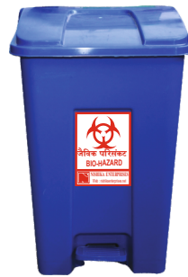
NE-25 50 litre