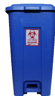
NE-26 60 litre (with wheel)