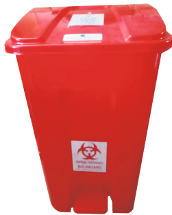
NE-234 40 litre