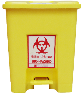
NE-22 15 litre