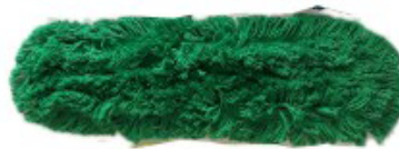
Dry Mop Refill Cotton NE0067