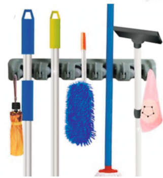
Mop and Broom Holder NE0074