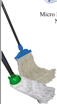
String/Cup Mop Set NE00611