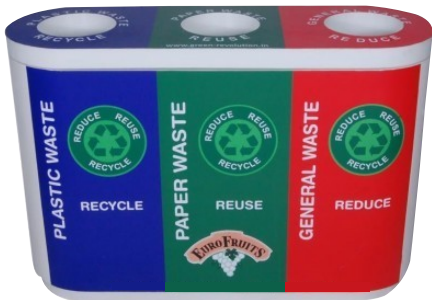
Colour Coded Swing Dustbin