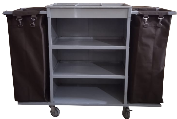
Maids Cart Trolley Size L 53", W 17", H 41"