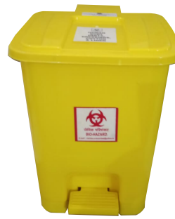
NE-239 (20 Litre)