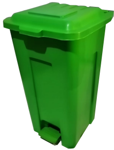
NE-235 65 litre