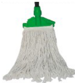
Wet Mop Refill NE0069