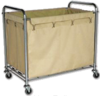
Linen Trolley Available Size (920L x 560W x 910H) (760L x 560W 910H)