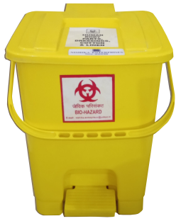
NE-237 (10 Litre)