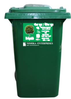
NE-212 240 litre