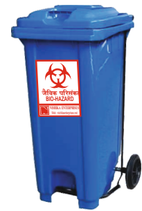
NE-28 120 litre CP