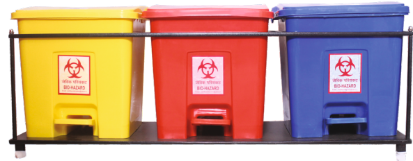
NE-519 MS 3 Bin set 32 litre