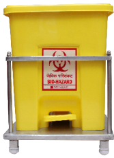
NE-513 SS Single Bin 20 liter