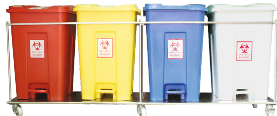
NE-0532 SS 4 Bin set 50 Litre with wheel