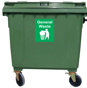
Available in 660 and 1100 liters