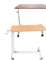
Over Bed Table