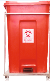
NE-529 SS Single Bin 50 Litre