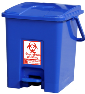
NE-21 10 litre