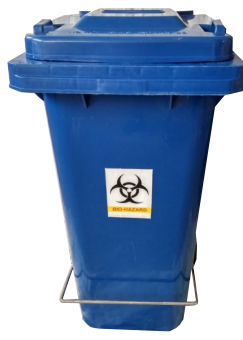
NE-210 240 litre FF