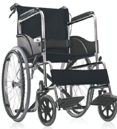
NE-79/Wheel Chair Folding