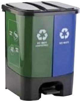
NE-77 (10+10 ltr.) & (20+20 ltr.)