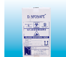
NE-117-18/2 & 5 litre

*Capacity can be customised for Card Board Box