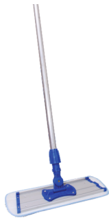
Micro Fibre Mop. Set NE00612