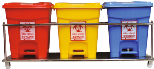
NE-57 SS 3 Bin set 15 litre