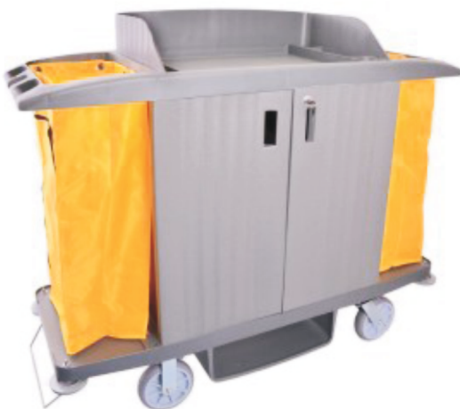
Maids Cart Trolley Size L 58", W 22", H 48"