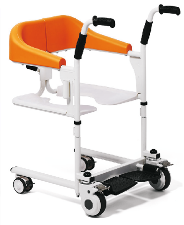
NE-83/Patient Transfer Chair