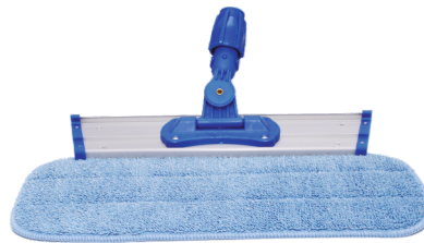
Micro fibre flat Mop with velcro Backing (Can be used for dry and wet Moping)