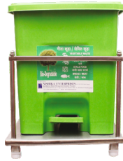
NE-513 SS Single Bin 20 liter