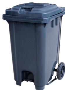
NE-27 80 litre