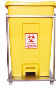
NE-529 SS Single Bin 50 Litre