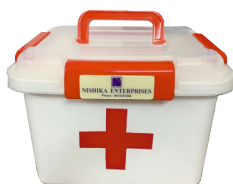
Medical Box (3ltr. & 5ltr.)