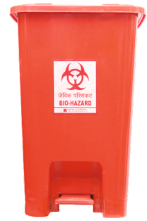
NE-228 (30 Litre)