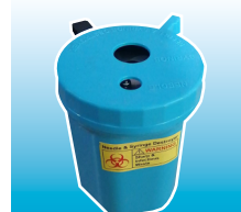
NE-251 / Syringe Needle cutter with ABS container