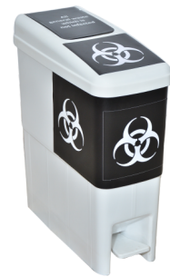
NE-32 21 litre