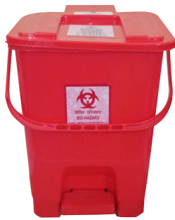
NE-238 (15 Litre)