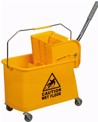
NE-63 (Capacity 15 Ltr.)