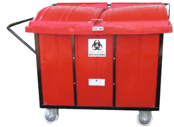
Available in 150, 250, 320, 450, 550, 1100 and 1200 liters with MS and SS Frame