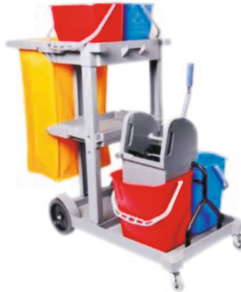
Multi Function Janitor Cart Available in 2 bucket and 3 bucket