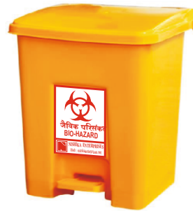
NE-23 20 litre