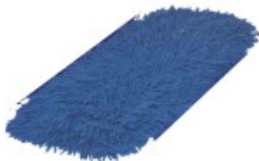
Dry Mop Refill-Acralic NE0066