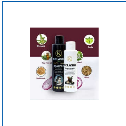
HERBAL SHAMPOO AND CONDITIONER