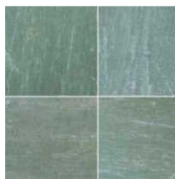
Lime Green Limestone