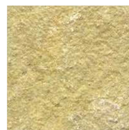
Tandoor Yellow Limestone