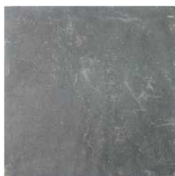
Kadappa Black Limestone