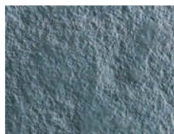
Tandoor Blue Limestone