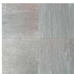
Lime Peacock Limestone