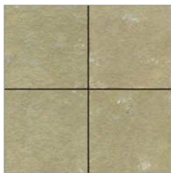
KOTA BROWN LIMESTONE