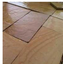
KOTA DESERT LIMESTONE