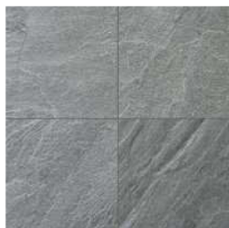
Silver Gray Natural Quartzite