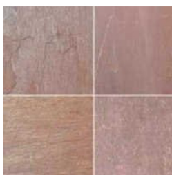
Lime Pink Limestone