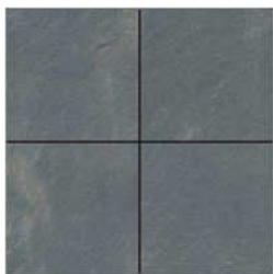
Cuddapah Black Limestone