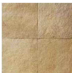
French Vanilla Limestone