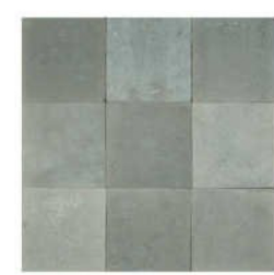
Misty Blue Limestone