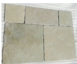
Yellow Lime Stone