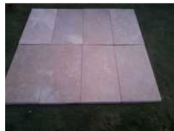
Kota Honey Limestone