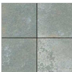
Kota Blue Limestone