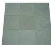
Lime Blue Limestone