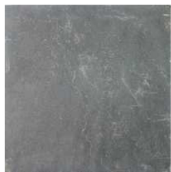
LIME BLACK LIMESTONE

Absolute Black Granite, Absolute Black Granite Slab, African Gold Slate Stone, Agra Red Cobble, Agra Red Marble, Agra Red Sandstones, Alaska Blue, Alaska Gold, Alaska White Granite, Amba Gold Granite, Amba White Granite, Antique Fireplaces, Antique Marble Fireplaces, Asian Top Granite, Autumn Brown Sandstone, etc.