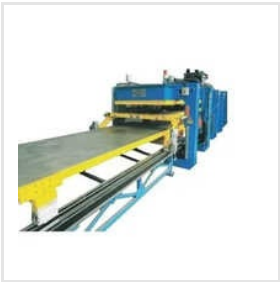
Sandwich Panel Making Presses