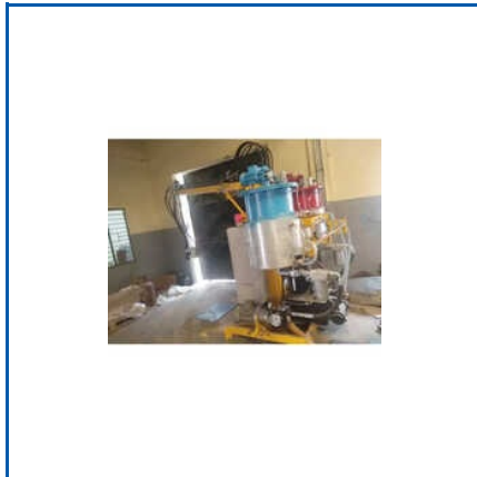
AUTOMATIC PU FOAM MACHINE