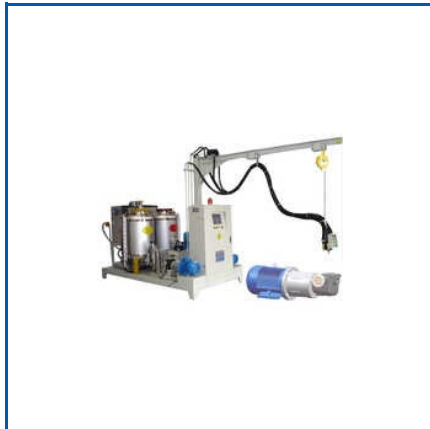
LOW PRESSURE PU FOAMING MACHINE