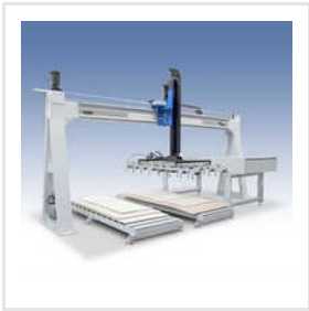
Single Polyurethane Manipulator