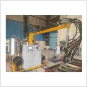
415 V PU Foaming Machine