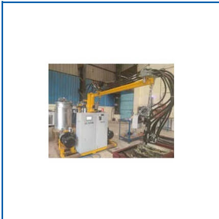
415 V PU FOAMING MACHINE

High Pressure PU Foaming Machine, Low Pressure PU Foaming Machine, Oval Conveyor, PU Foaming Machines, Panel Making Presses, Polyurethane (PU) Foaming Machines, Roll Crusher, Table Conveyor, etc.