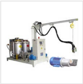
Low Pressure PU Foaming Machine