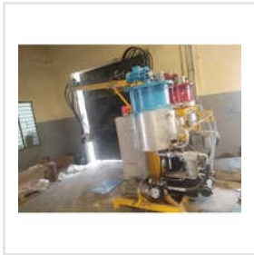
Automatic PU Foam Machine