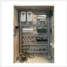
Three Phase PLC Control Panel