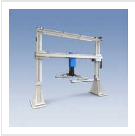
Electric Polyurethane Manipulator