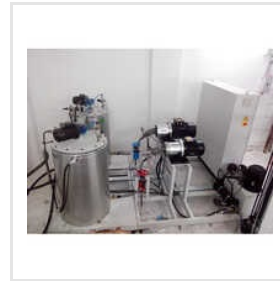
High Pressure PU Foaming Machine