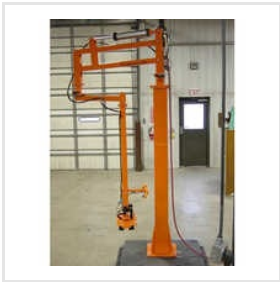
3 Axis Polyurethane Manipulator