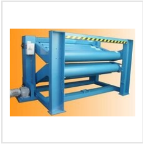
Mild Steel Roller Crusher Machine