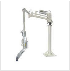
Automatic Polyurethane Double