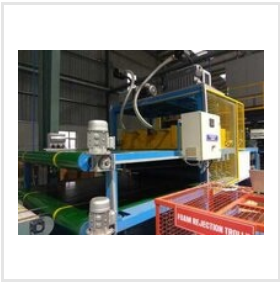
Vacuum Cum Roller Crusher