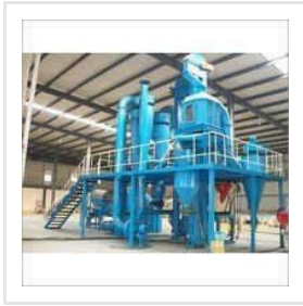
Agro Based Plant