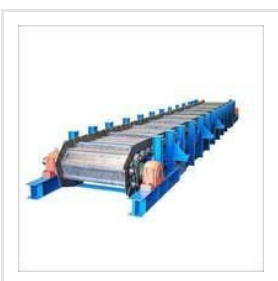
Apron Conveyor Chain