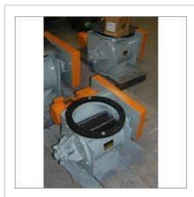
Rotary Vane Feeder