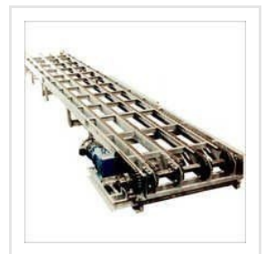
Drag Chain Pallet Conveyor