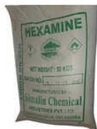
White Hexamine Powder