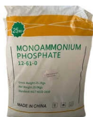
AGRICULTURE GRADE MONOAMMONIUM PHOSPHATE

57-13-6 Imported Technical Grade Urea, 98 Percent Super Potassium Humate Flakes, AUS 32 Diesel Exhaust Fluid, Agriculture Grade Monoammonium Phosphate, Ammonium Sulfate DCM, Ammonium Sulphate Technical Grade, Ammonium Sulphate Fertilizer, Anatase B101 Titanium Dioxide, Anatase Titanium Dioxide, Calcium Chloride Lumps, Calcium Chloride Powder, Cattle Feed Pellet, Caustic Soda Flakes, Citric Acid Powder, Cow Pellet Cattle Feed, etc.