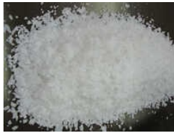
Caustic Soda Flakes