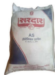
AMONIUM SULPHATE FERTILIZER