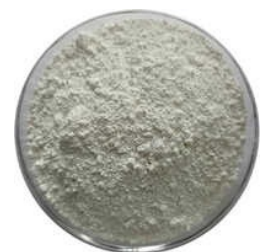
Titanium Dioxide Powder