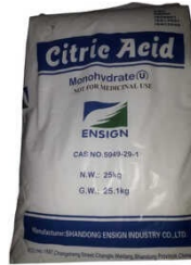
Citric Acid Powder