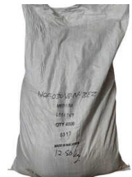
Plastic PP Bag