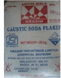
GACL Caustic Soda Flakes