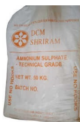
AMMONIUM SULFATE DCM