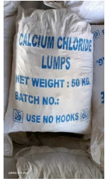
Calcium Chloride Lumps