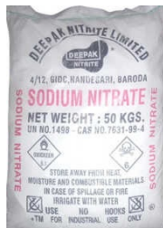
Sodium Nitrite Powder