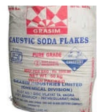
DCM Shriram Caustic Soda Flakes