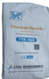
Titanium Dioxide Rutile Anatase