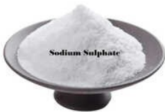
Industrial Sodium Nitrate