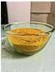
GOLDEN YELLOW WATER SOFTENER RESIN

2-5mm Fluoride Removal Media, Activated Carbon Granular, Analog Pressure Gauges, Apartment Sewage Treatment Plant, Arsenic Removal Media, Carbon Block Filter CTO, Coconut Shell Activated Carbon, Commercial Sewage Treatment Plant, Domestic Hard Water Softener, FRP RO Plant, Filtriva String Wound Filter, Filtriva Water Filter Housing Set Big Blue Jumbo, Golden Yellow Water Softener Resin, High Flow Nylon Monofilament Cartridge Filter Bag, Industrial Filter Bag, etc.