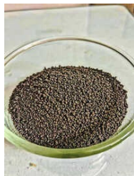
IRON REMOVAL MEDIA IRM 10