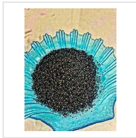
Coconut Shell Activated Carbon