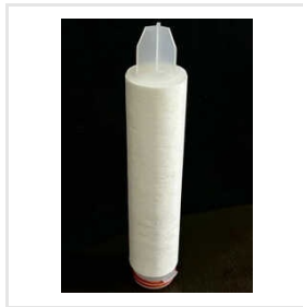
PP Spun RO Water SOE Filter Cartridge