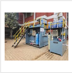
Packaged Effluent Treatment Plant