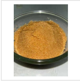
Mixed Bed Resin