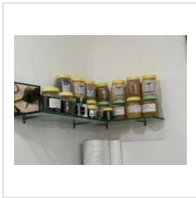
Water Softener ION Exchange Resin