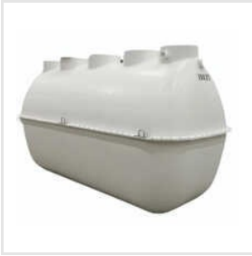
Packaged Sewage Treatment Plant