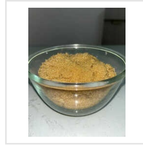
Strong Acid Cation H Resin