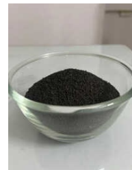
SUPERME IRM 20 IRON REMOVAL MEDIA