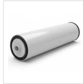
Industrial RO Membrane 8040