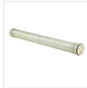
Industrial RO Membrane 4021