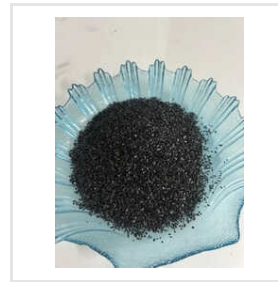
Activated Carbon Granular