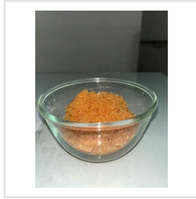
Weak Based Anion OH Resin