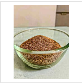
Arsenic Removal Media