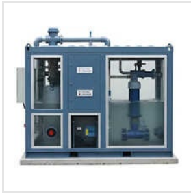
Apartment Sewage Treatment Plant