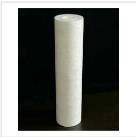
PP Spun RO Water DOE Filter Cartridge