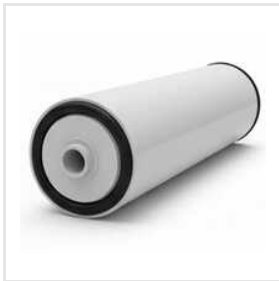
Industrial RO Membrane 4040