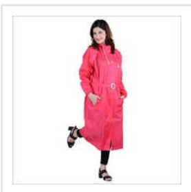
Ladies Polyester Full Sleeves Raincoat