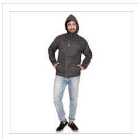
Mens Nylon Taffeta Rain Jacket