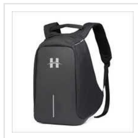
Anti Theft Laptop Backpack