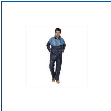
NOBLE PRIZE RAINSUIT