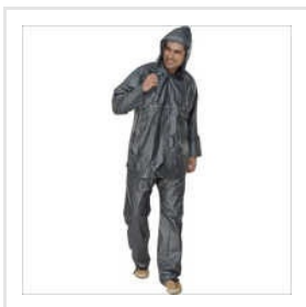
Mens PVC Full Sleeves Rainsuit