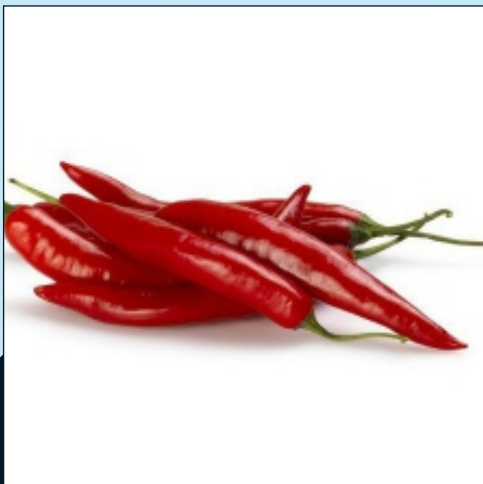
Preserved Red Chilli