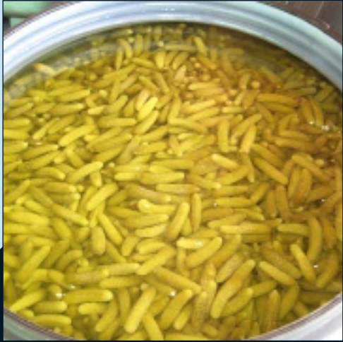
Gherkins in Acetic Acid