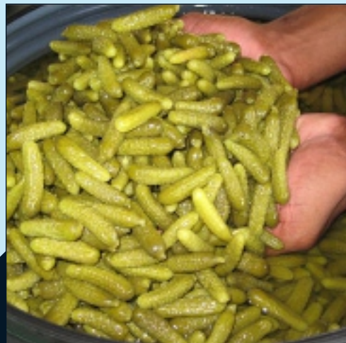
Gherkins in Vinegar