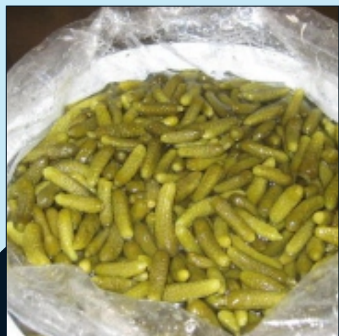
Baby Cucumbers In Plastic Pails