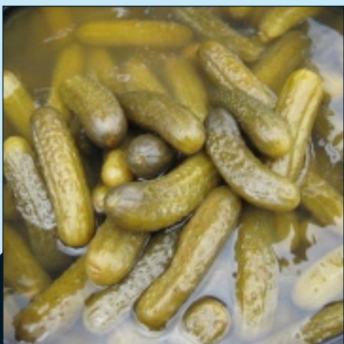
Gherkins In Salt Brine