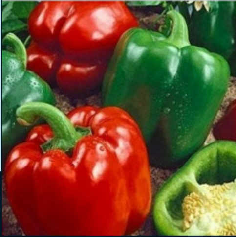
Preserved Bell Pepper