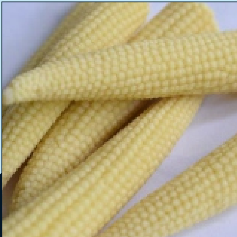
Preserved Baby Corn