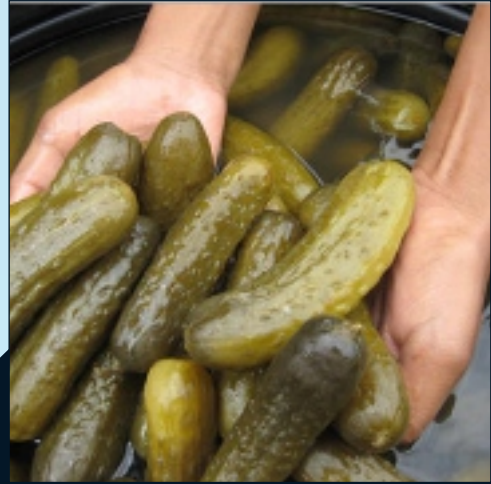
Gherkins in Salt Brine