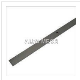
Syncro Cross Cutter Knives