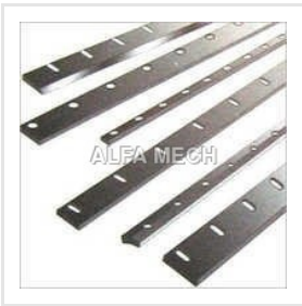
Duplex Sheet Cutter Knives