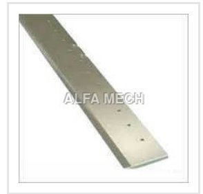
Paper Cutting Guillotine Knives