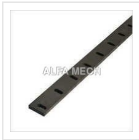
Sheet Cutting Knives