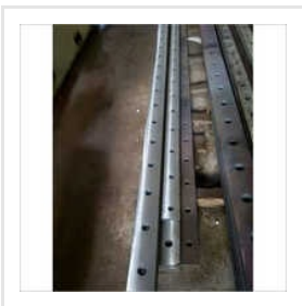
Paper Sheet Cutter Knife