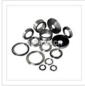
Bottom Circular Knives