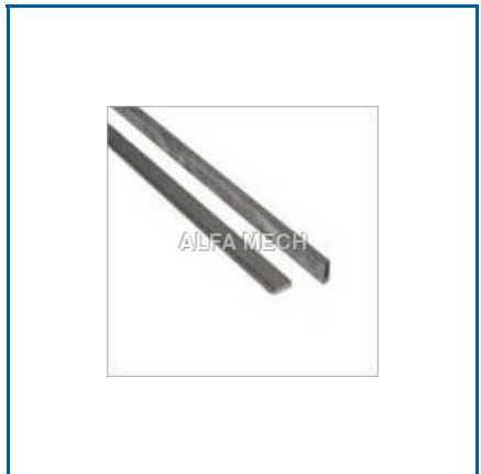
CROSS CUTTER KNIVES