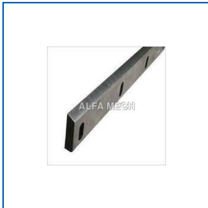
PAPER CUTTING KNIVES