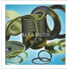
Multi Edge Knives