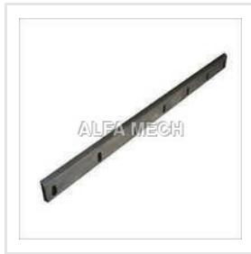
Sheet Cutter Knife