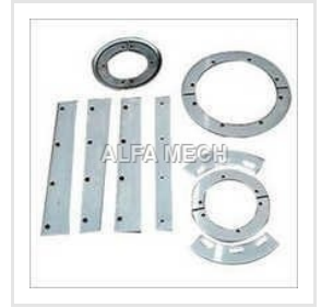
Top Slitter Knives