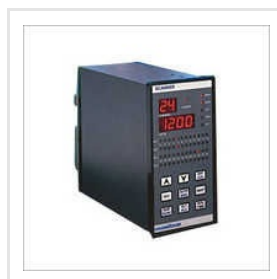
Digital Scanners Loggers