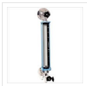
Glass Level Indicator