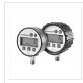
Digital Pressure Gauge