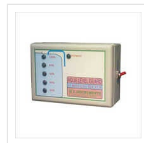
Water Level Indicator