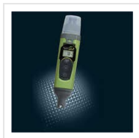
EcoTester Series Measuring Tester