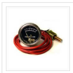
Dial Temperature Gauges