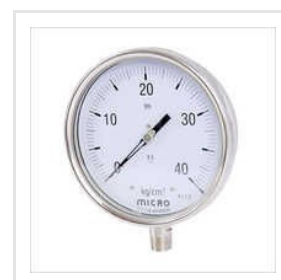
Weather Proof Pressure Gauges