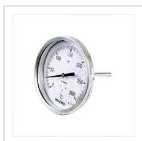
Bimetal Temperature Gauges