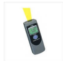
OPTEX HANDHELD MEASURING METER