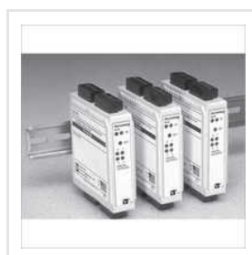
Multi-Channel Analog Input Modules