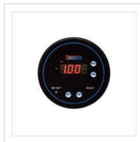
Digital Differential Pressure Gauge