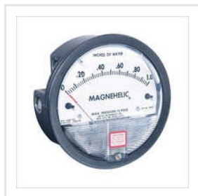
Dwyer Magnehelic Gauge