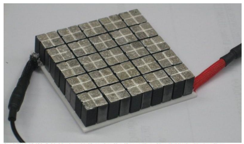
Part# CMO-25-42S Cold side view with 25 couples. Size 42 mm x 42 mm Silver(Ag) leads with glass fiber insulation. Design for temperatures up to 800°C

<u>Torque requirements:</u> 5 N.m is approximately 45 in/lbs (inch pounds) or 3 ft/lb (foot pounds). VERY LITTLE TORQUE! 4 x SUS304 M6 screws.