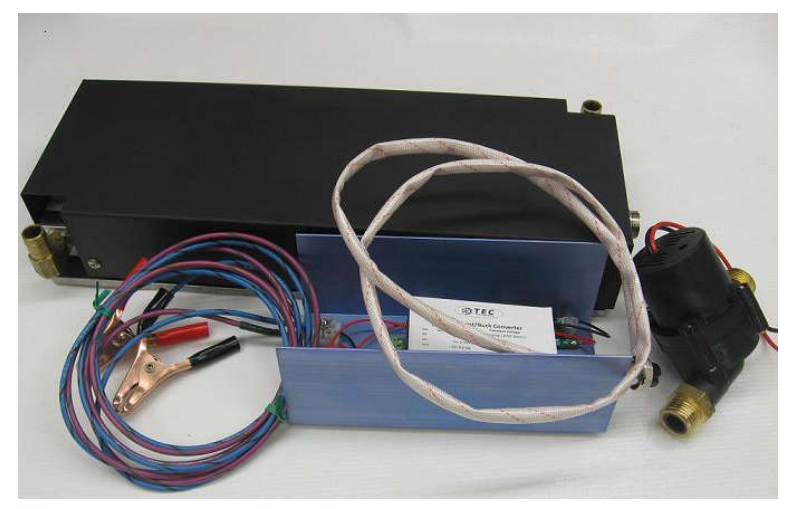
DESIGNED & MANUFACTURED IN CANADA

(*OUTPUT BASED ON MAXIMUM HOT SIDE TEMPERATURE and DT)