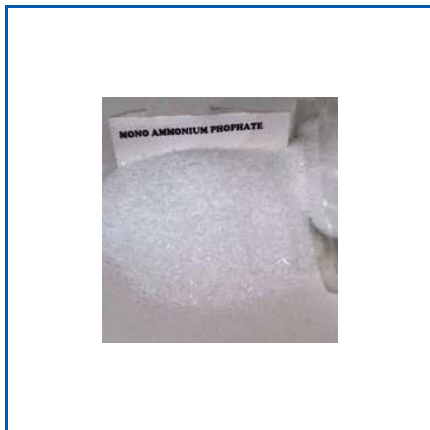
LESS WATER CONSUMABLE FERTILIZERS-MAP