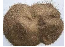
Dead Burnt Magnesite