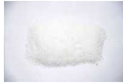
Best Quality Mono Ammonium Phosphate