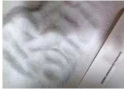
Macronutrients With High Quality Of MAP