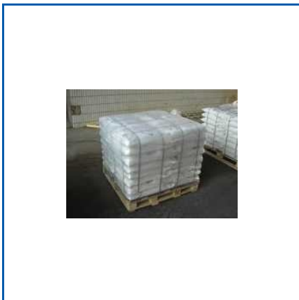
SODA ASH FROM ROMANIA

100 % Water Soluble Fertiliser- Map - 12:61:00, 100 % Water Soluble Potassium Humate Powder, 100% WATER SOLUBLE FERTILIZER, 100% Water Soluble - MAP, 100% Water Soluble Agricultural Fertilizers-map, 100% Water Soluble Fertilizer - MAP, 100% Water Soluble Macronutrients Fertilizer - MAP, 100% Water Soluble Macronutrients Fertilizer -Mono Ammounium Phosphate, 100% Water Soluble of Macronutrients, 100% Water Soluble of Macronutrients-MAP, 100% Water Soluble of Macronutrients-N:P:K - 12:61:00-MAP, 100% water soluble of MAP (N:P:K - 12:61:00), 100% water soluble of Macronutrients-N:P:K - 12:61:00, 12:61:00, 46% Nitrogen Content Urea (Technical Grade), etc.