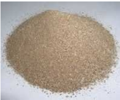
Caustic Calcined Magnesite