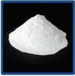
Sodium Carbonate (Soda Ash) 99.2% -