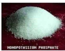
Imported Mono Potassium Phosphate