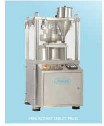
Mini Rotary Tablet Press