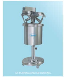
Deburring And Dedusting Machine