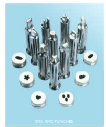
Dies And Punches