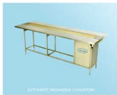
Automatic Packaging Conveyor