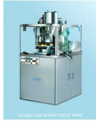
Double Side Rotary Tablet Press