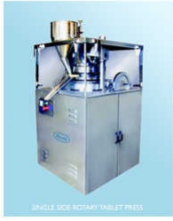
Single Side Rotary Tablet Press