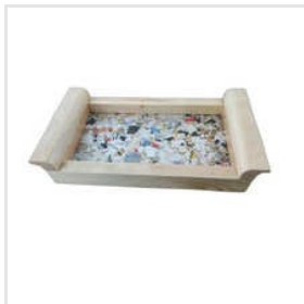
Recycled Plastic Desk Tray