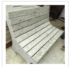
Recycled Plastic Outdoor Garden Bench