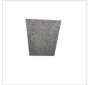
18mm- 20mm Recycled Plastic