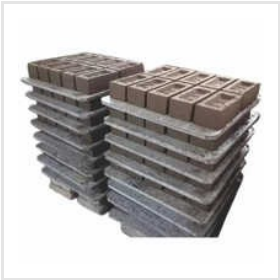
Recycled Plastic Sheet Brick Pallets