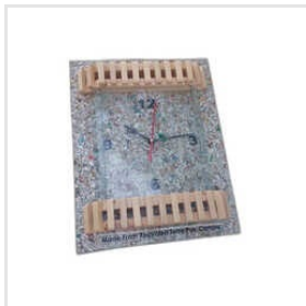
Recycled Wall Cock For Gift