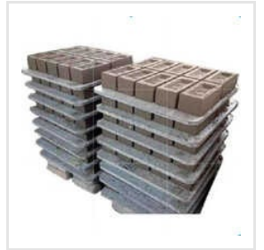
Recycled Brick Pallet