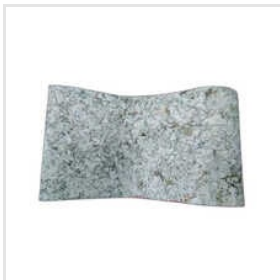
Recycled Plastic Roofing Sheet