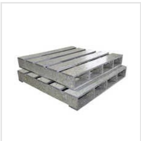
Recycled Plastic Pallets For Industrial