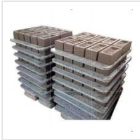
Recycled Plastic Pallets