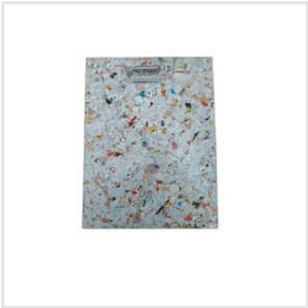
Recycled Plastic Exam Clip Board