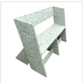
Recycled Plastic Garden Bench