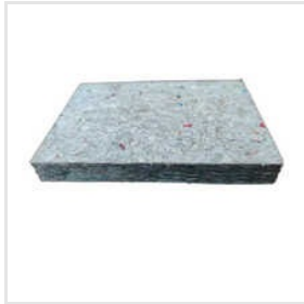
EcoRegrow Recycled Plastic Sheet