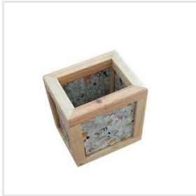
Recycled Plastic Pen Holder