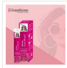
L Glutathione Efferevescent Third