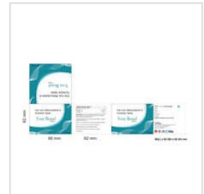
Folic Acid Methycolbalmin &