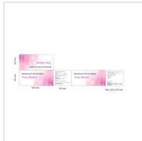
Mecobalamin & Folic Acid Third Party