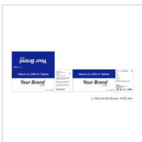
Vitamin D3 Third Party Manufacturing Tablets