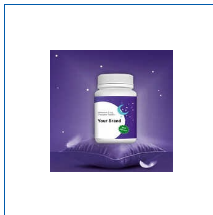
MELATONIN CHEWABLE THIRD PARTY MANUFACTURING TABLETS