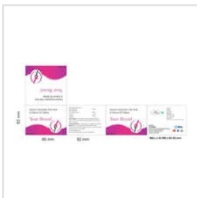
Calcium Carbonate Folic Acid & Vitamin D3