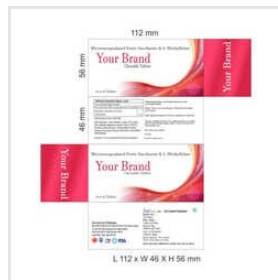
Microencapsulated Ferric Saccharate & L-