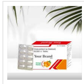
Cholecalcifero Third Party Manufacturing