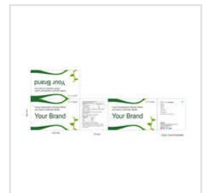
Cissus Quadaragloris, Moringa Oriflera And