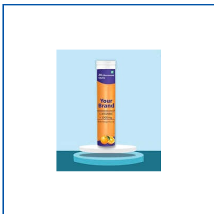
L-ARGININE EFFERVESCENT THIRD PARTY MANUFACTURING TABLETS

Adenosylcobalamin Carbonyl Iron & Folic Acid Third Party Manufacturing Tablets, Alpha Ketoanalogua Of Essential Amino Acid Tablet, Antioxidant, Vitamin, Amino Acid, Minerals, Myo-Inositol, D-Chiro-Inositol & Melatonin Tablets, Astaxanthin, Lutein, Zeaxanthin Vitamin A, Vitsmin C, Vitamin E, & Antioxidants Tablets, Biotin Calcium D-Pantothenate Histidine Cystenine Copper Iron Selenium Niacinamide Tablets, etc.