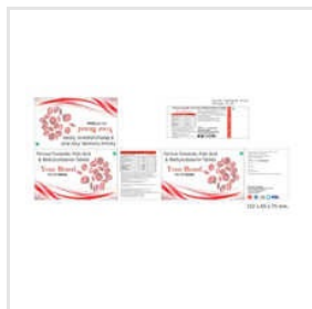
Ferrous Fumarate Folic Acid &