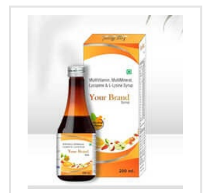
Multivitamin Multiminerall Lycopene