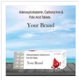
Adenosylcobalamin Carbonyl Iron & Folic