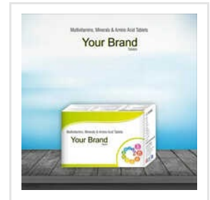
Multivitamins Minerals & Amino Acid Third