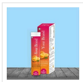
Multivitamin Efferevescent Third