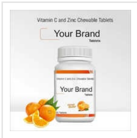
Vitamin C And Zinc Chewable Third Party