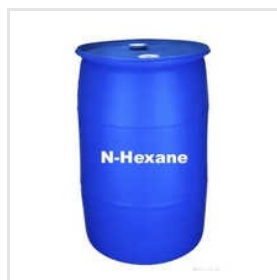
200L N Hexane Liquid