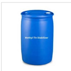
Alkyne 250 Kg Methyl Tin Stabilizer Powder