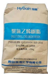
HYGAIN 25 KG PVC RESIN POWDER

100 kg MTO Chemical Solvent, 200L N Hexane Liquid, 210 kg Liquid Benzene Chemical, 215 kg DOP Polymer Additive Liquid, 25 kg PE Wax Polymer Additive, 25 kg Zinc Stearate Polymer Additive, 250 kg Liquid Toluene Chemical, 250L Industrial Solvent Degreaser Chemical, 25kg Propel PP Granules, 50 kg Epoxy Resin A Polymer Additive, 50 kg Liquid Dispersing Agent, Alkyne 10 kg Titanium Dioxide Rutile, Alkyne 25 kg Optical Brightener Powder, Alkyne 250 kg Methyl Tin Stabilizer Powder, Alkyne 270 kg Textile Printing Thickener Powder, etc.