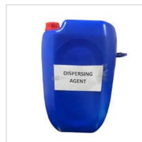
50 Kg Liquid Dispersing Agent