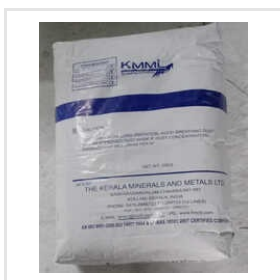
Kmml 25 Kg Titanium Dioxide Rutile