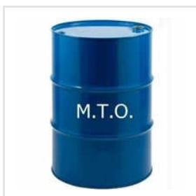
100 Kg MTO Chemical Solvent