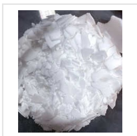
25 Kg PE Wax Polymer Additive