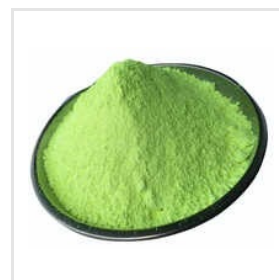
Alkyne 25 Kg Optical Brightener Powder