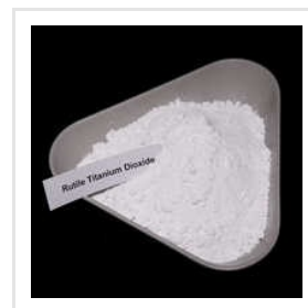
Alkyne 10 Kg Titanium Dioxide Rutile