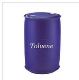
250 Kg Liquid Tolune Chemical