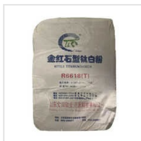
Jinhai 25 Kg Titanium Dioxide Rutile