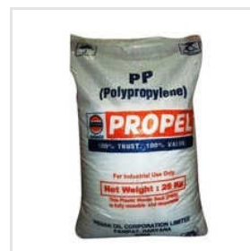
25kg Propel PP Granules