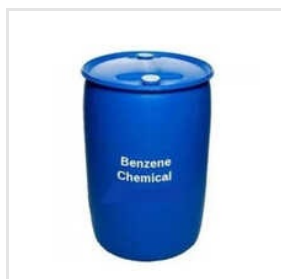
210 Kg Liquid Benzene Chemical