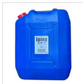
50 Kg Epoxy Resin A Polymer Additive