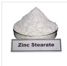
25 Kg Zinc Stearate Polymer Additive