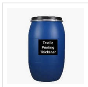
Alkyne 270 Kg Textile Printing Thickener