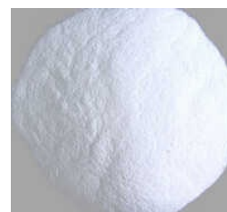
SHINETSU PVC POLYVINYL CHLORIDE POWDER