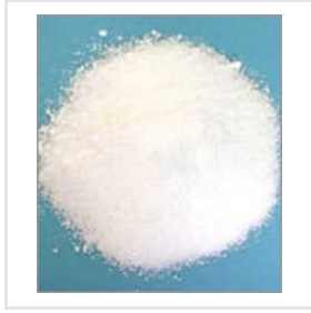
Sodium Ortho Vanadate