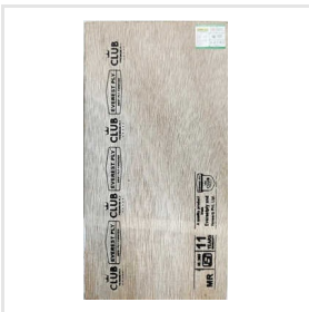
Everest Plywood Sheet