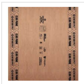
Centuryply Plywood Board