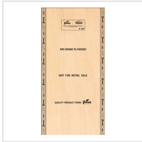
Greenply Plywood Boards