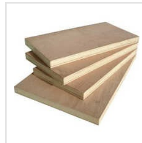
MR Grade Plywood