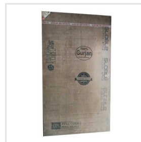
Global Plywood Board Sheet