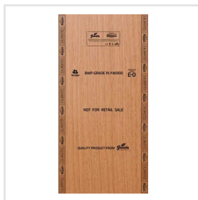
Greenply Plywood Sheet