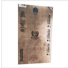
Kennex Gold Plywood Board