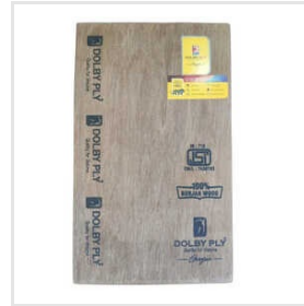
Dolby Plywood Sheet