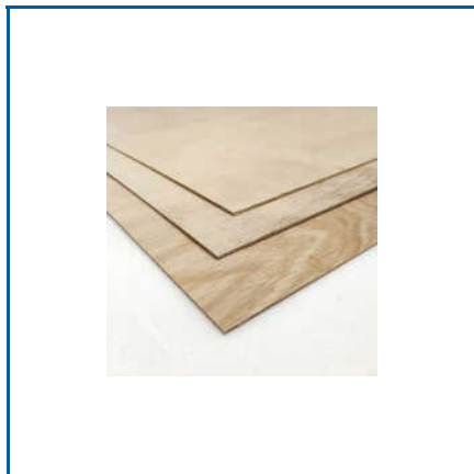
WATERPROOF PLYWOOD BOARD