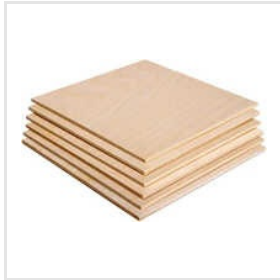
Hardwood Plywood Board