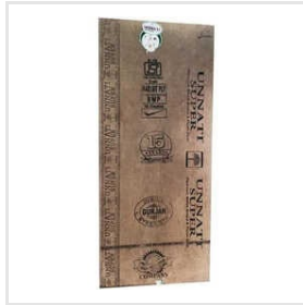
Unnati Super Plywood Board