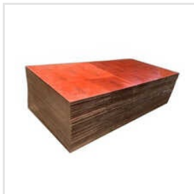
Shuttering Plywood Board