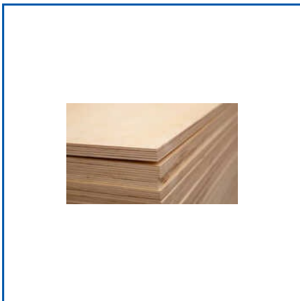
MARINE PLYWOOD SHEET