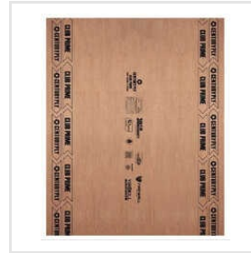
Century Plywood Sheet