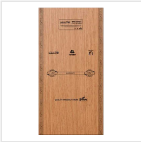
Bwp Plywood Board