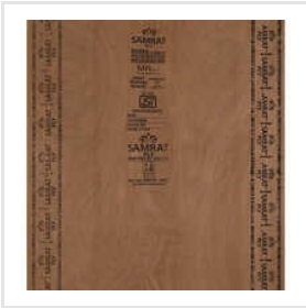
Samrat Plywood Sheet