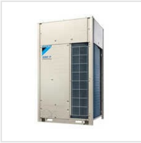
VRV Air Conditioner