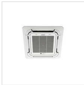
Iron Cassette Air Conditioner