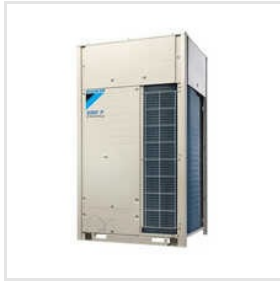
Daikin Vrv Systems