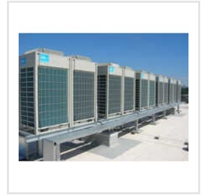
30 HP VRF System