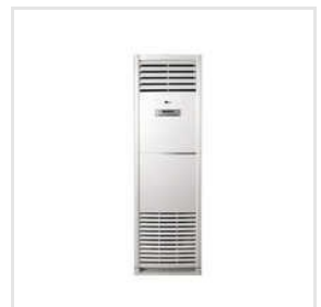
1 Ton Tower AC