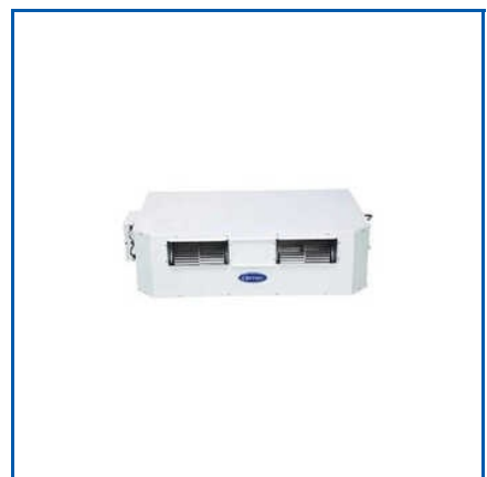
3 TON DUCTABLE SPLIT AIR CONDITIONER