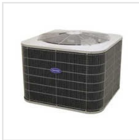
Stainless Steel Central Air Conditioner