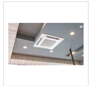
2 TR Carrier Cassette Air Conditioner