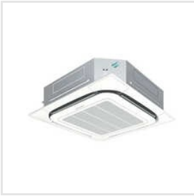
2 Ton Daikin Cassette Air Conditioners