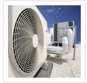
Commercial Air Conditioner