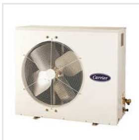
Carrier Ductable Air Conditioner