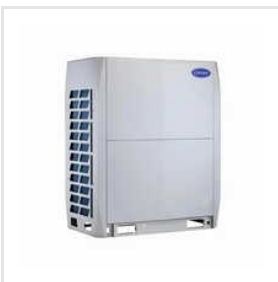
50 HP Carrier VRF System