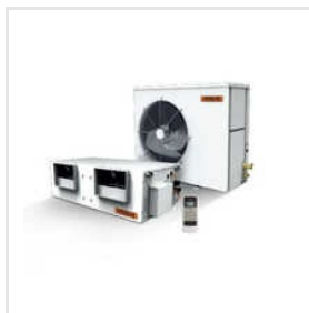
2 TR Ductable Ac Units