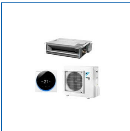
DAIKIN DUCTED AIR CONDITIONER

1 Ton Tower AC, 2 TR Carrier Cassette Air Conditioner, 2 TR Ductable Ac Units, 2 Ton Daikin Cassette Air Conditioners, 20 HP VRF System, 3 Ton Ductable Split Air Conditioner, 30 HP VRF System, 50 HP Carrier VRF System, Blue Star Ductable Air Conditioner, Carrier Ductable Air Conditioner, Commercial Air Conditioner, Daikin Ducted Air Conditioner, Daikin Vrv Systems, Iron Cassette Air Conditioner, Silver Stainless Steel Central Air Conditioner, etc.