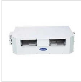
3 Ton Ductable Split Air Conditioner