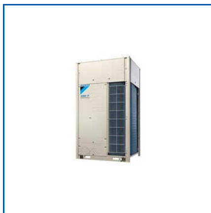
VRF AIR CONDITIONER