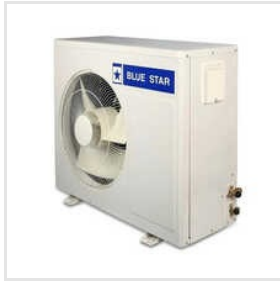
Blue Star Ductable Air Conditioner