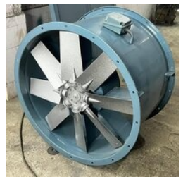
Tube Axial Fan