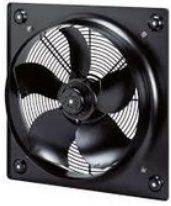
Chiller Condensor Cooling Fan