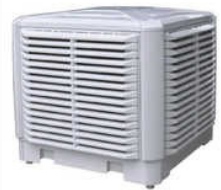
Evaporative Cooler Unit