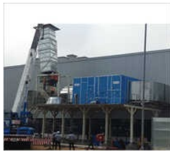
Double Skin Air Washer Evaporative Cooling