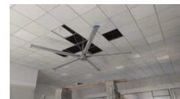
BLDC GEARLESS DC PMSAC DDM HVLS FAN