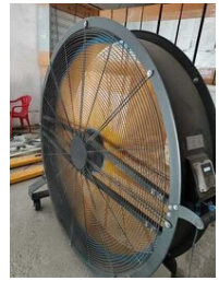
Mobile Pivot Floor Mounted HVLS Fan