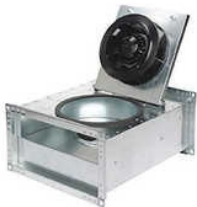
Inline Rectangular Fan