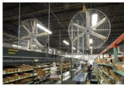
Wall Mounted High Volume Low Speed