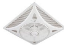
False Ceiling Mounted Cassette Fan