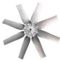
Axial Fan Impeller Blades