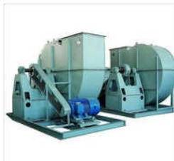
Industrial Heavy Duty Centrifugal Fan