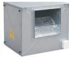
Inline Cabinet Fan