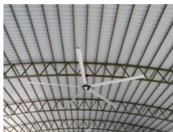
INDUSTRIAL HIGH VOLUME LOW SPEED FAN

Air Turbo Ventilator, Axial Fan Impeller Blades, BLDC Gearless DC PMSAC DDM HVLS Fan, Backward Curved Radial Fan, Chiller Condensor Cooling Fan, DIDW Fan, Double Skin Air Handling Unit, Double Skin Air Washer Evaporative Cooling Units, EC Fan, Evaporative Cooler Unit, External Rotor Motor Fans, False Ceiling Mounted Cassette Fan, Free Running Impellers Plug Fan, HVLS Fan, Heavy Duty Industrial Centrifugal Blower, etc.