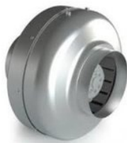
Inline Circular Fan