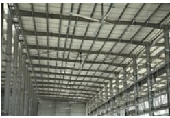
High Volume Low Speed Fans