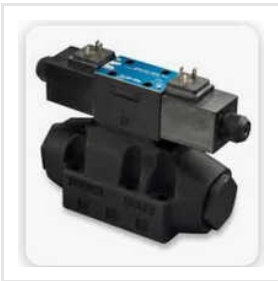
Hydraulic Directional Control Valves