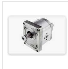
Rexroth Gear Pump