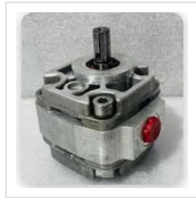
PGF1 Rexroth Gear Pump