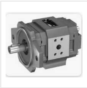
125cc Rexroth Internal Gear Pump