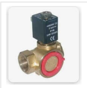
3 Inch Parker Control Valves