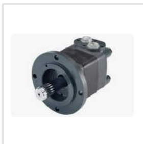
Omt 400 Danfoss Hydraulic Motor