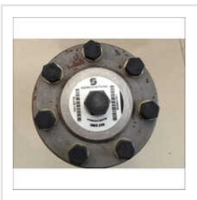
OMR200 Danfoss Hydraulic Motor