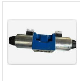
Automatic Hydraulic Directional Control