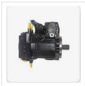
3 Inch Hydraulic Pressure Control Valve