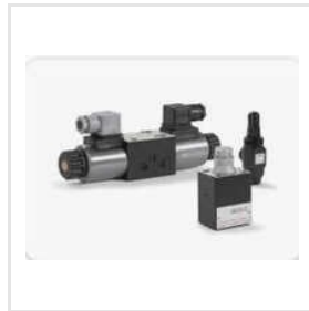
Atos Pressure Control Valve