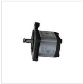
Rexroth Gear Pump