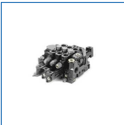
PARKER HYDRAULIC DIRECTIONAL CONTROL VALVE

0.5 Inch Atos Hydraulic Solenoid Valve, 0.75 Inch Hydraulic Valves, 1 Inch Pressure Relief Valve, 1 Inch Rexroth Hydraulic Proportional Valve, 1.4 inch Atos Servo Proportional Valve, 1.5 Inch Atos Proportional Valves, 125cc Rexroth Internal Gear Pump, 16 Inch Atos Proportional Valve, 2.5 Inch Direction Control Valve, 20 Bar Hydraulic Servo Valves, 20 Bar Moog Servo Hydraulic Valve, 20 LPM Rexroth Hydraulic Piston Pump, 2HP Double Vane Pump, 3 Inch Hydraulic Pressure Control Valve, 3 Inch Parker Control Valves, etc.