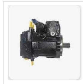
3 Inch Hydraulic Pressure Control Valve