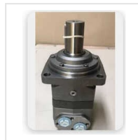
OMV 630 Danfoss Hydraulic Motor