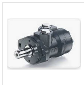
Sauer Danfoss Hydraulic Motor