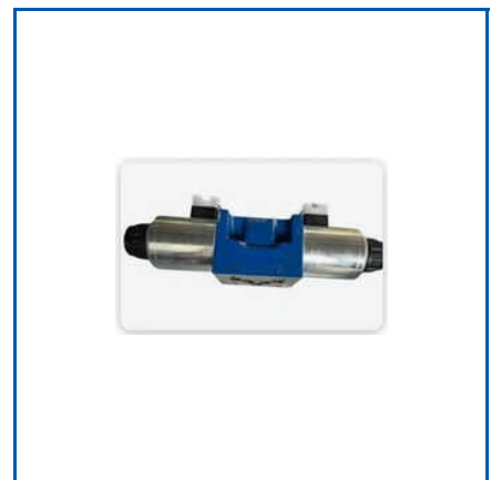
AUTOMATIC HYDRAULIC DIRECTIONAL CONTROL VALVE