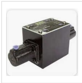
Lever Operated Directional Control