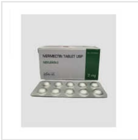
Iverjohn 3 Mg