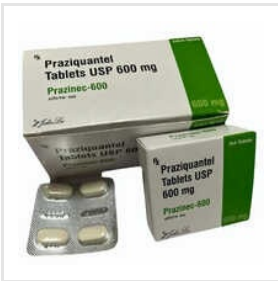
600mg Prazinec Praziquantel Tablets