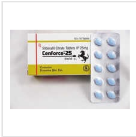
25mg Cenforce Sildenafil Citrate