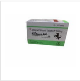
100mg Cenforce Sildenafil Citrate