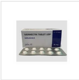
Iverjohn 6mg Tablets