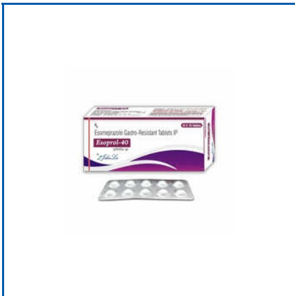
40MG ESOMEPRAZOLE GASTRO-RESISTANT TABLETS

0.1%WW Bidin Ls Brimonidine Tartrate Eye Drop, 0.5 Mg Caberlin Cabergoline Agonist Tablet, 0.5 Mg X Vir Entecavir Tablet, 0.5mg Budelite Budesonide Nebuliser Suspension, 0.5mg Cabgolin Cabergoline Tablet, 0.5mg Entavir Entecavir Tablets IP, 0.6% Besivance Besifloxacin Ophthalmic Suspension Bottle, 1 Mg Glimestar Glimepride Tablets, 1% Brinzagan Brinzolamide Ophthalmic Suspension, 10 Mg Methandienone Tablets, 10 Mg Winstrol Stanozolol Tablets, 100 Mcg Levothyroxine Sodium Tablets, 100 Mg Budecort Budesonide Inhaler, 100 Mg Methenolone Enanthate Injection, 100 Mg Nandrolone Phenylpropionate, etc.