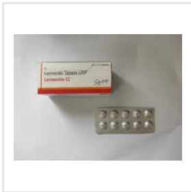
Covimectin 12 Mg