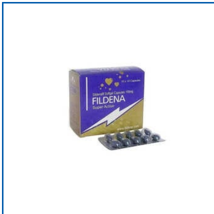
100MG FILDENA SILDENAFIL SOFTGEL CAPSULES