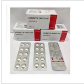
Iverjohn 12 Mg