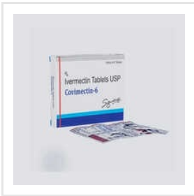
Covimectin 3 Mg