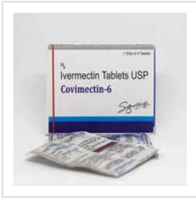
Covimectin 6 Mg