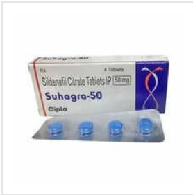
50mg Suhagra Sildenafil Citrate