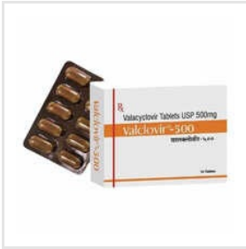
500mg Valclovir Valacyclovir Tablets