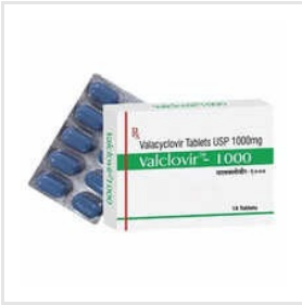
1000mg Valclovir Valacyclovir Tablets