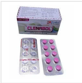
40mcg Clenabol Tablet