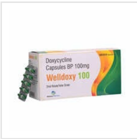
100mg Welldoxy Doxycycline Capsules