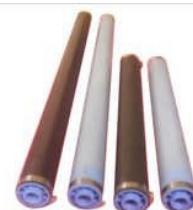
FINE PORE MEMBRANE DIFFUSER