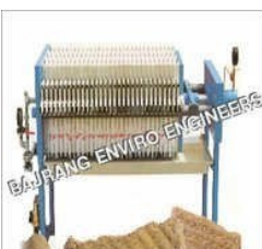
Water Treatment Filter Press