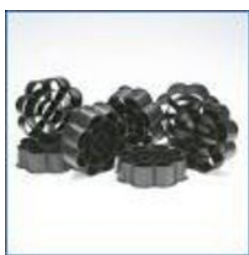
Random Bio Media