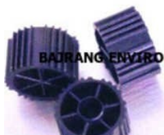
BIO PAC MEDIA