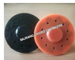
COARSE BUBBLE DISC DIFFUSER