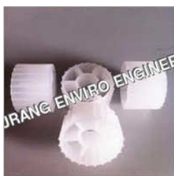
MbbR Media Products