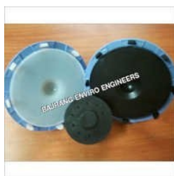
COARSE BUBBLE DIFFUSER

Automatic Touchless Sanitizer Dispencer, BIO PAC MEDIA, Bubble Tube Diffuser, Coarse Bubble Diffuser, Coarse Bubble Disc Diffuser, Diffuser sleeve, Disc Diffuser, Effluent Treatment Plant Equipment, etc.