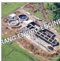
Sewage Treatment Plant Equipment