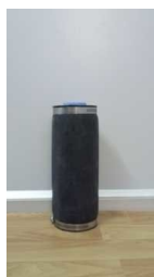
Fine Bubble Vertical Tube Diffuser