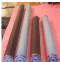
FINE BUBBLE TUBE DIFFUSER