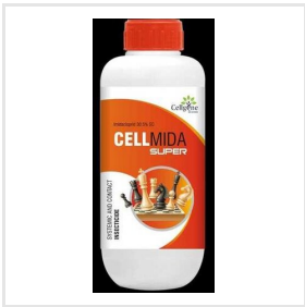
IMIDACLOPRID 30.5 SC