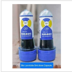
DROWN Bio Insecticide