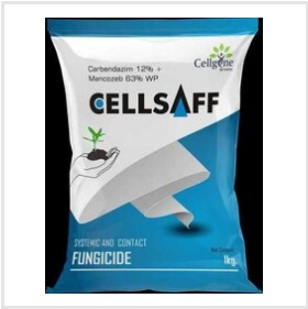
CARBENDAZIM 12 MANCOZEB 63