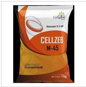
MANCOZEB 75 WP FUNGICIDES