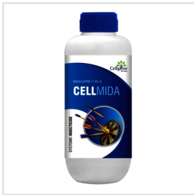
IMIDACLOPRID 17.8% SL