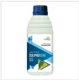
SULPHUR 55.16 SC