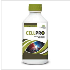
PROFENOPHOS 50 EC