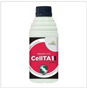
DELTAMETHRIN 11 EC