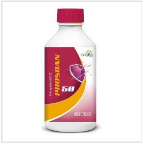
CHLORPYRIPHOS 50% EC