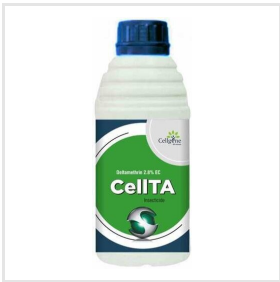
DELTAMETHRIN 2.8 EC