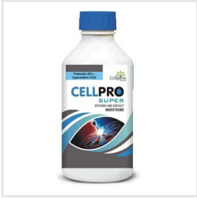
PROFENOPHOS 40 CYPERMETHRIN 4 EC