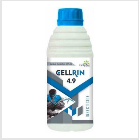
LAMBDA CYHALOTHRIN 4.9 CS