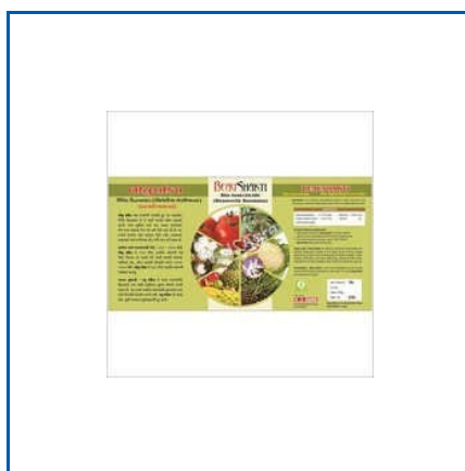
BEAUVERIA BASSIANA BIO PESTICIDE