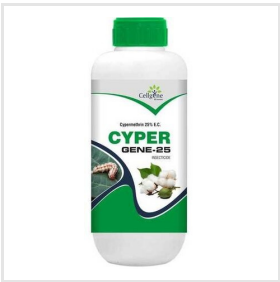
CYPERMETHRIN 25% EC INSECTICIDES