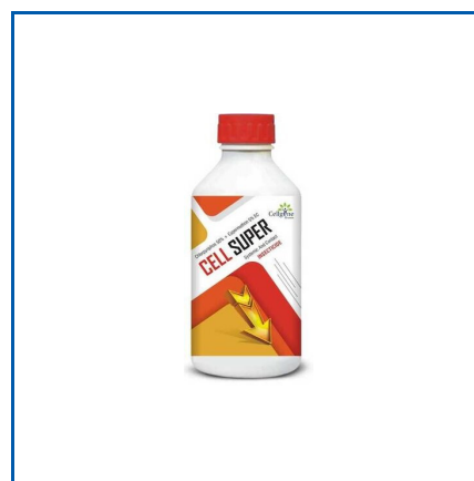
CHLORPYRIPHOS 50 CYPERMETHRIN 5 EC