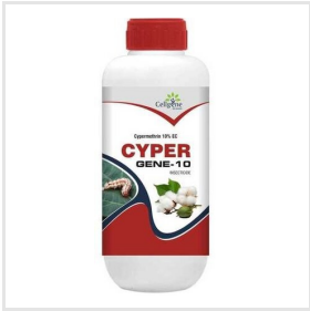
CYPERMETHRIN 10% EC