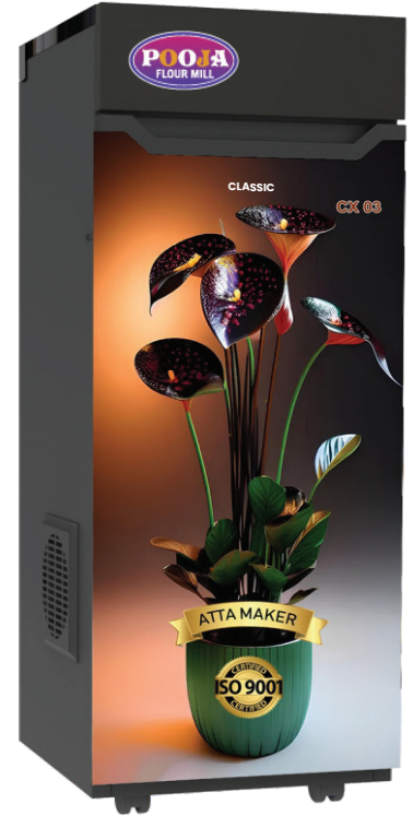
CLASSIC JUMBO 20990/- CX-03