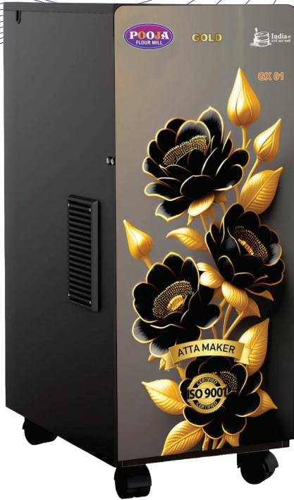
GOLD GX-01 19990/-