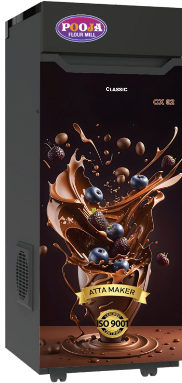
CLASSIC JUMBO 20990/- CX-02