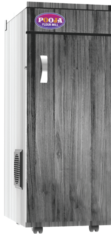
DIGITAL 07 KG 15990/-