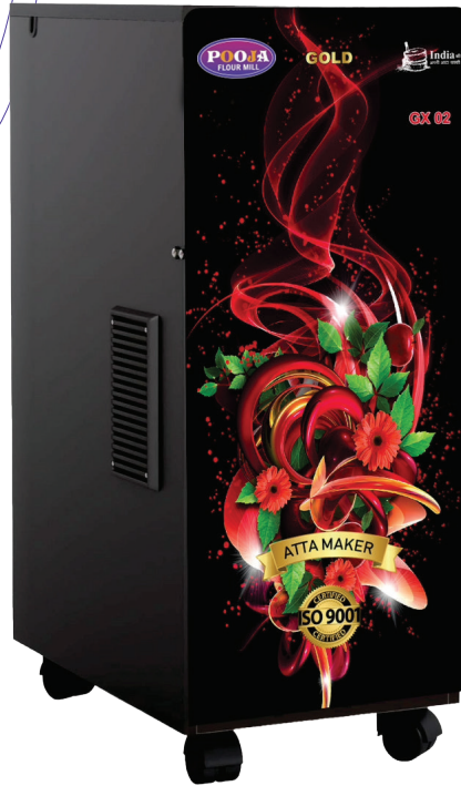
GOLD GX-02 19990/-