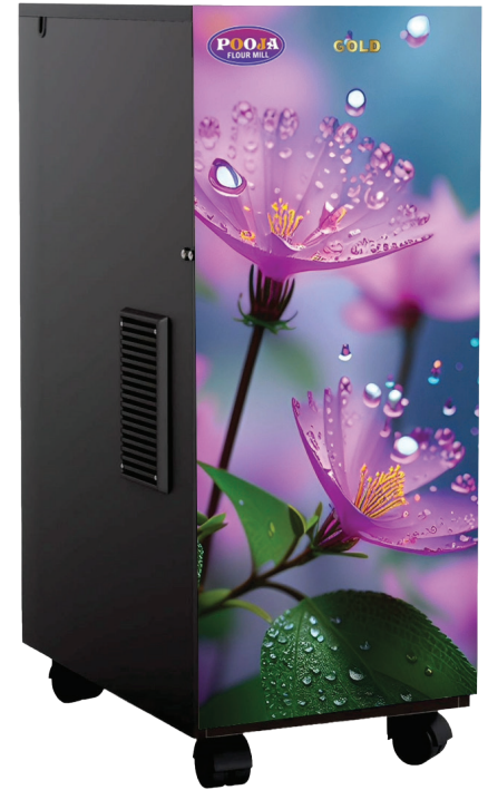
GOLD GX-03 19990/-