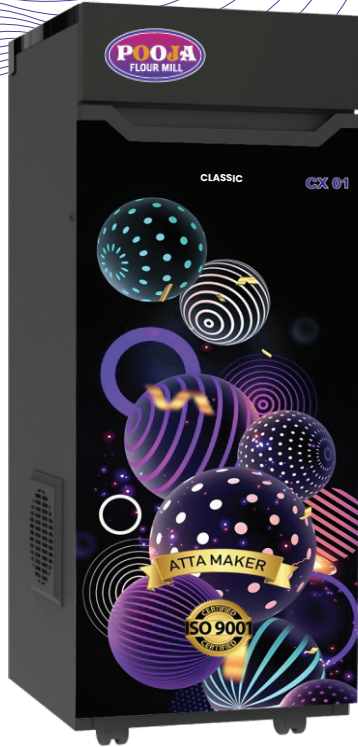
CLASSIC JUMBO 20990/- CX-01