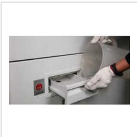
High Low Temperature Test Chamber