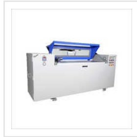
Salt Spray Test Chamber