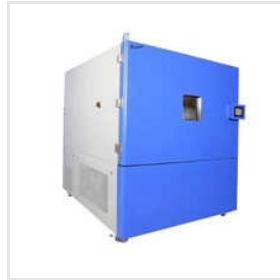
High Low Test Chamber