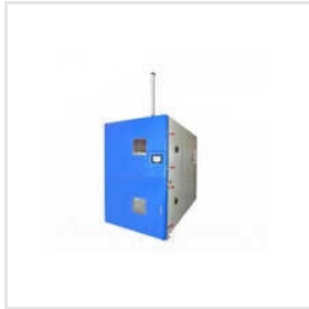
Thermal Shock Chamber