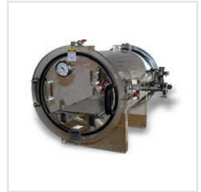
Vacuum Test Chamber