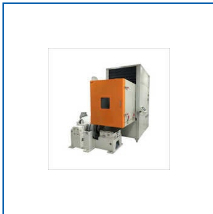
VIBRATION TEST CHAMBER