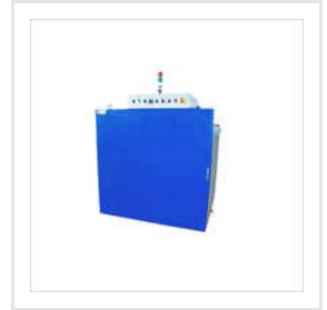
Dry Heat Test Chamber