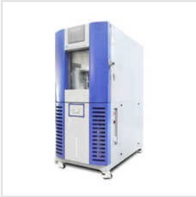
Sand And Dust Test Chamber