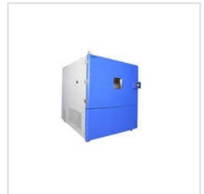
Climatic Test Chamber