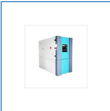
CLIMATIC TEST CHAMBER

Altitude Chambers, Climatic Test Chamber, Conditioning Chamber, Cyclic Corrosion Test Chamber, Dry Heat Chamber Ovens, Dry Heat Test Chamber, Dust Chamber, Dust Test Chamber, Environmental Test Chambers, Full Spectrum UV Simulation, Growth Chambers, High Low Temperature Test Chamber, High Low Test Chamber, Horizontal Conveyor Oven, Humidity Chambers, etc.