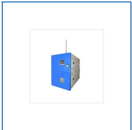
THERMAL SHOCK TEST CHAMBER