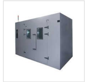
Environmental Test Chambers