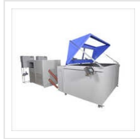
Cyclic Corrosion Test Chamber