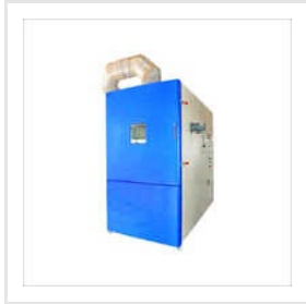
Dust Test Chamber