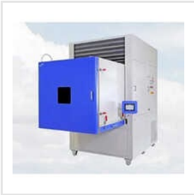
Vibration Tester Chamber