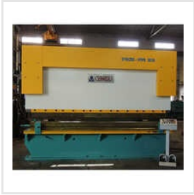
VFPB-3030 Hydraulic Syncro Press Brake