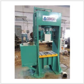
Industrial Hydraulic Press