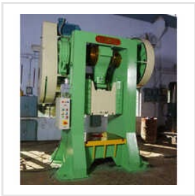
H Frame Mechanical Power Press