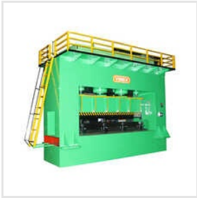
Hydraulic Power Press