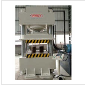
4 Pillar Hydraulic Press