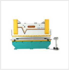
MS Hydraulic Press Brake Machine