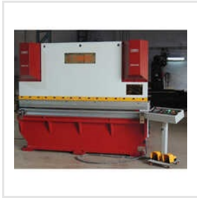
VPB-1625 Hydraulic Press Brake