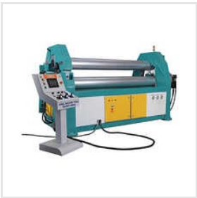
Industrial 3 Roll Plate Blending Machine