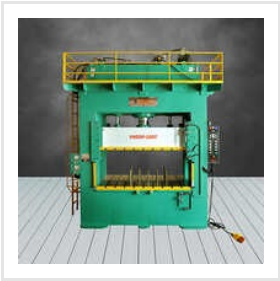
VHDDP-200T Hydraulic Deep Draw Press