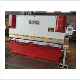
VPB-1030 NC Hydraulic Press Brake