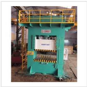
Hydraulic Deep Draw Press With PLC And NC