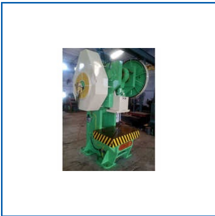
C FRAME PNEUMATIC CLUTCH POWER PRESS

C type power press, Deep Draw, General spares, Hydraulic Products, Hydraulic shears, Petter spares, Petter type engine, Pinchcum, Pressbrake, Research, Shaping machine, Trimming & Blanking Press, Under Crank Shearing Machine, etc.