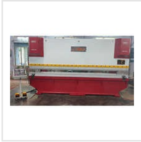
VPB-2540 Hydraulic Press Brake