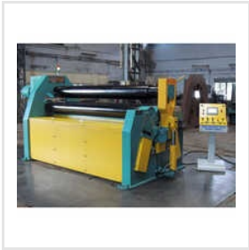
Hydraulic Plate Bending Machine