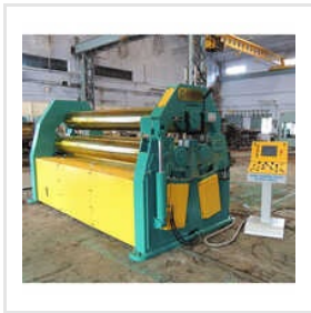
3 Roll Plate Bending Machine