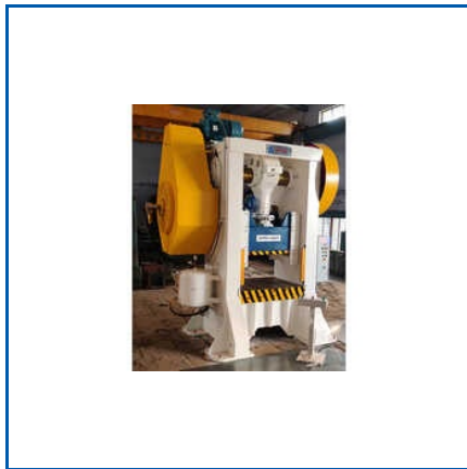
H FRAME PNEUMATIC CLUTCH POWER PRESS