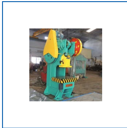
C FRAME MECHANICAL POWER PRESS