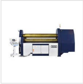
4 Roll Plate Bending Machine