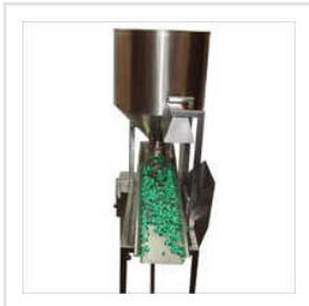
Capsule Inspection Machine