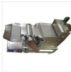
PHARMACEUTICAL PRE-SORTER MACHINE