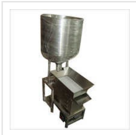
Capsule Diametrical Sorter Machine