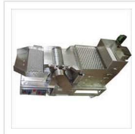
Pharmaceutical Pre-Sorter Machine