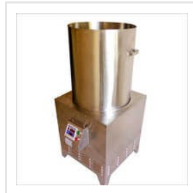
Stainless Steel Aeration Unit