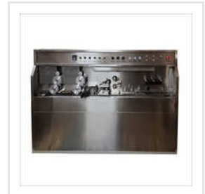
Circular Capsule Printing Machine