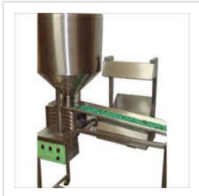
Capsule Sorting Machine