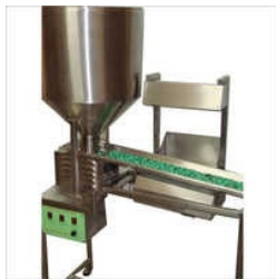
CAPSULE SORTING MACHINE

Automatic Capsule Filling Machine, Capsule Diametrical Sorter Machine, Capsule Inspection Machine, Capsule Sorting Machine, Circular Capsule Printing Machine, Pharmaceutical Pre-Sorter Machine, Stainless Steel Aeration Unit, Stainless Steel Capsule Loader Machine, etc.