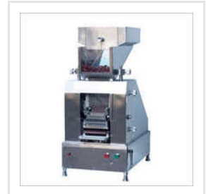
Stainless Steel Capsule Loader Machine