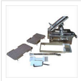
Automatic Capsule Filling Machine