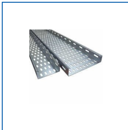
GI PERFORATED CABLE TRAY