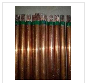
Copper Earthing Electrode