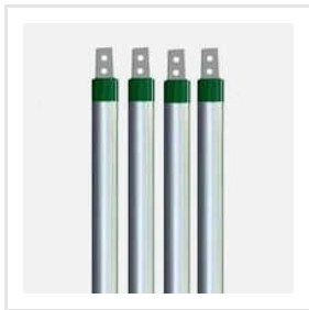
Gi Chemical Earthing