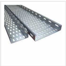
Perforated Cable Tray