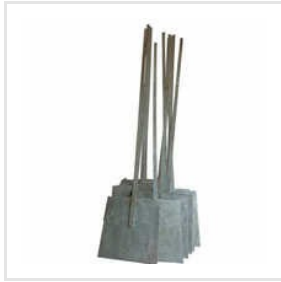
Gi Plate Earthing