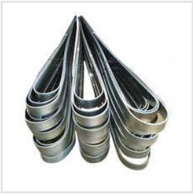
Gi Hot Dip Strip