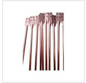
Copper Bonded Earthing Rod