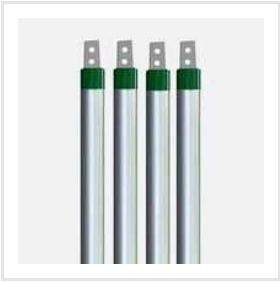
GI Chemical Earthing Electrode