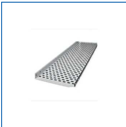
ELECTRICAL CABLE TRAY

01_Copper Plate Earthing, Advance Lightning Arrester, Cable Tray, Charcoal For Earthing, Chemical Earthing, Copper Bonded Earthing Rod, Copper Chemical Earthing, Copper Coated Earthing Rod, Copper Earthing, Copper Earthing Electrode, Copper Plate, Copper Strip, DMC Insulator, Earthing Charcoal, Earthing Salt, etc.