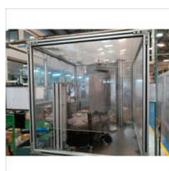
Industrial Online Gauging System