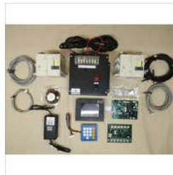
Finger Print Based Smart Locker Control