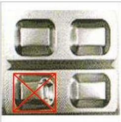
ProCam BVS Blister Vision System