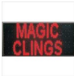
INDOOR LED DISPLAY