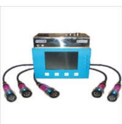
UNIPCR-50 Pharma Code Reader