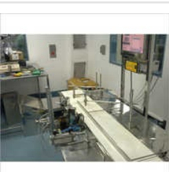
Industrial Track And Trace System