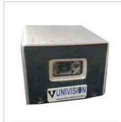
UNIPCR PCR 40 Pharma Code Reader