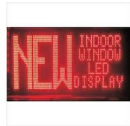
ELECTRIC LED DISPLAY