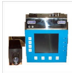
UNICON 60 Industrial Code Reader