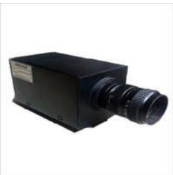
ProCam Programmable Smart