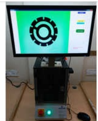
Electric Gauging And Profile Display System