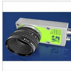
VC6211 Nano Smart Camera