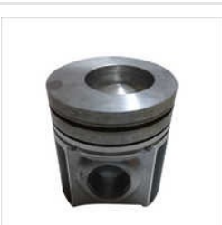
Pro Cam GVA 50 Gauging Vision System