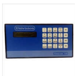
Electronic CAM With Controller