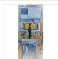
Industrial Blister Vision System