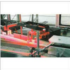
Procam Label Vision System