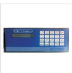
UNIPCR-10 Pharma Code Reader