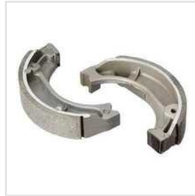
Brake Shoe Hero Honda