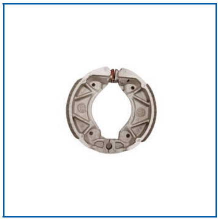
YAMAHA FAZER REAR BREAK SHOE