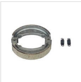
Brake Shoe Splendor