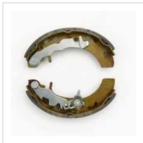
Brake Shoe Piaggio Ape Cty Rear