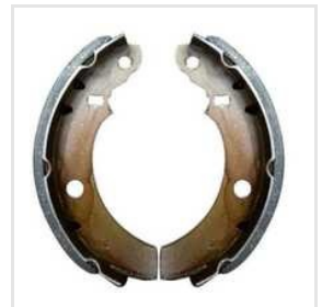
Brake Shoe Bajaj 3 Wh Re