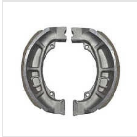
Brake Shoe Suzuki Access