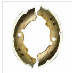
Brake Shoe Mahindra Alfa