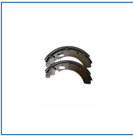
BAJAJ 3 WH OLD MODEL

Bajaj 3 Wh Old Model, Brake Shoe Activa, Brake Shoe Bajaj 3 Wh Re, Brake Shoe Hero Honda, Brake Shoe Jupiter, Brake Shoe Piaggio Ape Cty Rear, Brake Shoe Pulsar, Brake Shoe Splendor, Brake Shoe Suzuki Access, Brake shoe Mahindra Alfa, GC Brake Shoe, KB4S Brake Shoe, Yamaha Fazer Rear Break Shoe, etc.