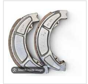
Brake Shoe Jupiter