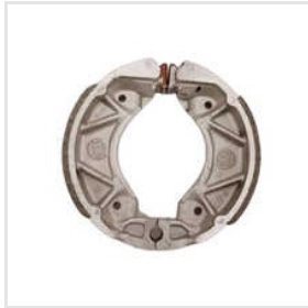
Yamaha Fazer Rear Break Shoe