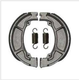
Brake Shoe Activa