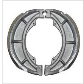
Brake Shoe Pulsar