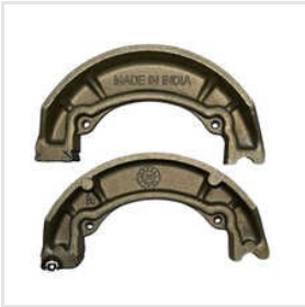
KB4S Brake Shoe