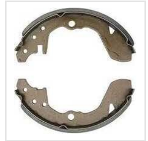
GC Brake Shoe