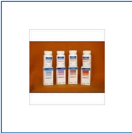
LENALID NATCO CAPSULES

5-fluorouracil Injection, ALIMTA Pemetrexed Injection, Abamune Tablets, Abirapro Tablet, Alimta Injection, Alphalan Tablet, Altraz Anastrozole Tablet, Anti Cancer Medicines – Hepcinat 400mg, Anticancer Drugs, Aprecap Capsule, Arimidex Tablet, Armotraz Anastrozole Tablet, Aromasin Tablet, Atgam Injection, Avonex (Interferon Beta 1A), etc.