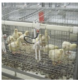
Poultry Chicks Cage