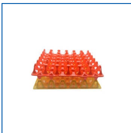
PLASTIC EGG TRAY