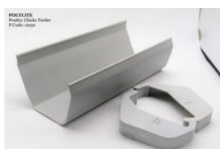
Poultry Chicks Feeder