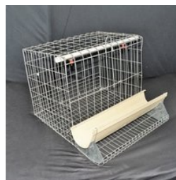
Poultry Layer Cage