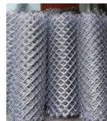
Chain Link Fencing