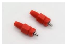
Poultry Nipple 360 Degree