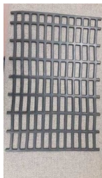
Poultry Cage Mat