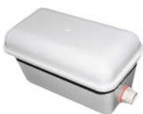
Poultry Water Tank (5liter)