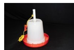
Poultry Chicks Baby Feeder