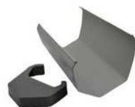
Poultry Layer Feeder (V TYPE)