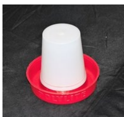
Poultry Cage Feeder