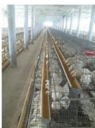
Poultry Grower Cage