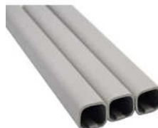
22mm Square Poultry Drinker