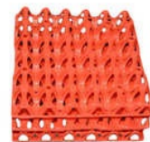
Commercial Plastic Egg Tray (Hatchery)