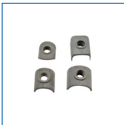
PVC POULTRY NIPPLE SADDLE

22mm Square Poultry Drinker, 50mm Poultry Water Channel, Automatic Pan Feeding System, Chain Link Fencing, Chicks Cum Grower Cage, Chicks Cum Grower Feeder, Commercial Plastic Egg Tray (hatchery), Eco Friendly PVC Flexible Pipe, High Strength PVC Junction Box, Indoor Water Tank, PVC Conduit Pipe, PVC Fitting, PVC Plumbing Pipe, PVC Poultry Nipple Saddle, PVC SWR Pipe, etc.