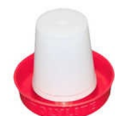
Plastic Poultry Cage Drinker