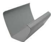
Poultry Feeder Layer Square