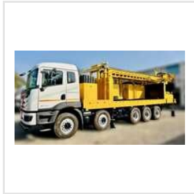
DTH Drilling Rig Machine