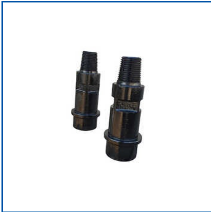
DTH RIG ROD ADAPTER

Borewell Drilling Machine, DTH Drilling Rig Machine, DTH Drilling Rod, DTH Hammer Bit, DTH Rig Rod Adapter, Water Well Drilling Rig Machine, Water Well Drilling Rod, etc.