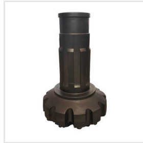
DTH Hammer Bit