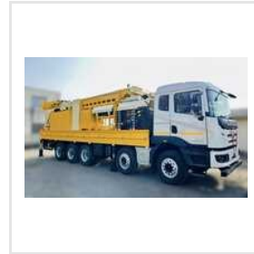
Water Well Drilling Rig Machine