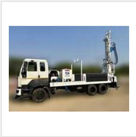
Borewell Drilling Machine