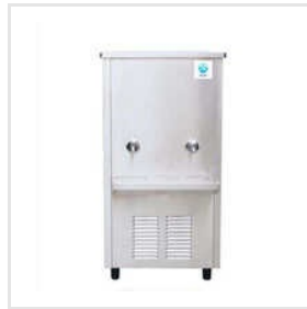
FS Regular Water Cooler