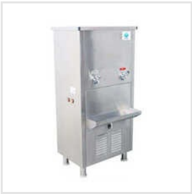
NHB Normal And Hot With RO Space Water