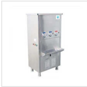
HCSA Hot Or Cold With RO Space Water Cooler