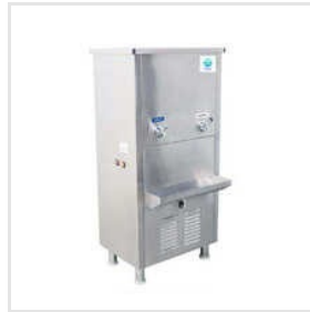
CNSA Cold Normal With Ro Space Water