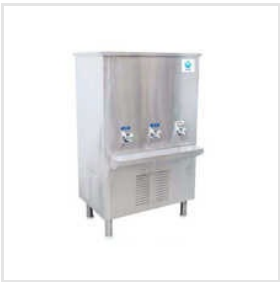
CNWA Cold Normal Without Ro Space