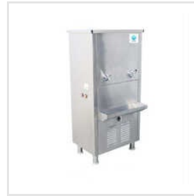
ROA Water Cooler With RO Space Water Cooler