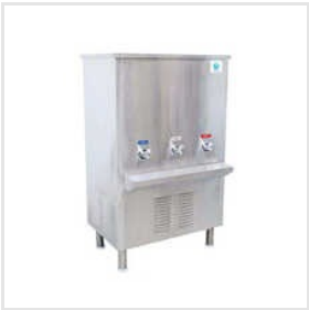
HWA Hot And Cold Or Normal With RO Space