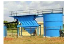
LAMELLA CLARIFIER PLANT