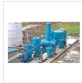
DM RO Water Treatment Plant