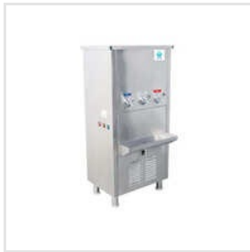
HSA Hot And Cold Or Normal With RO Space