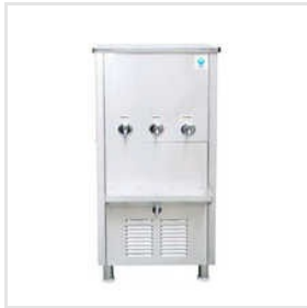
CA Normal With RO Space Water Cooler