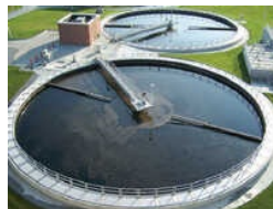
CLARIFIER AT STEEL MILL PLANT