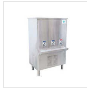
HCWA Hot Or Cold Without RO Space