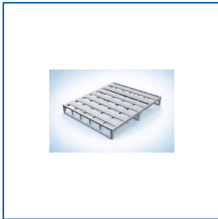
3 TON LOAD METAL PALLET 1000 X 1200 X 150 MM