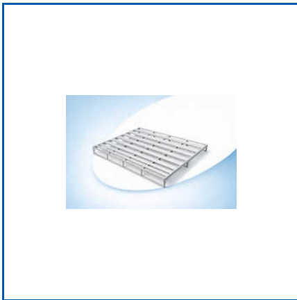
EXPORT METAL PALLET 1000 X 1200 X 150 MM

3 Ton Load Metal Pallet 1000 x 1200 x 150 mm, All Purpose Metal Pallet, Export Metal Pallet 1000 x 1200 x 150 mm, Metal Crate 800 x 600 x 300 mm, Metal Crate Load Capacity 1.5 Ton, Metal Pallet Stacked, Metal Ramp, etc.