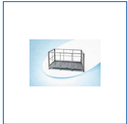
METAL CRATE LOAD CAPACITY 1.5 TON