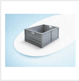
Metal Crate 800 X 600 X 300 Mm