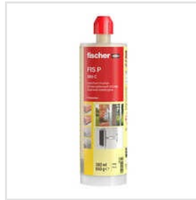
FIS P 380 C Injection Motar