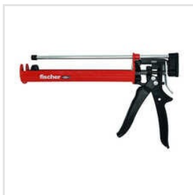
Dispenser FIS AM For 2 Chamber Cartridges