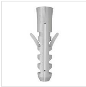
Expansion S Plug