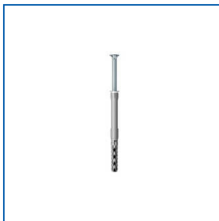
FRAME FIXING FASTENER