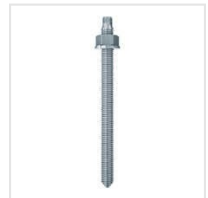
Anchor Rod RG M