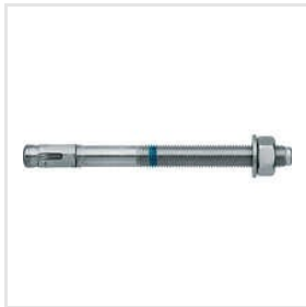
HSA-R SS Wedge Anchor