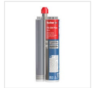
FIS EM Plus 585 S Injection Motar