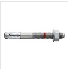
HST4 Wedge Anchor