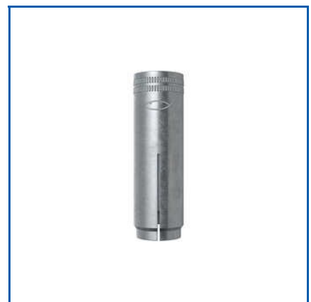
EA-N HAMMERSET ANCHOR