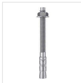
Bolt Anchor FWA