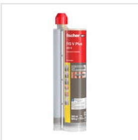
FIS V Plus 360 S Injection Motar