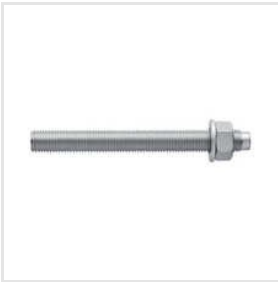
HIT-V-5.8 Anchor Rod