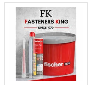
Fischer FIS V Plus Injection Mortar