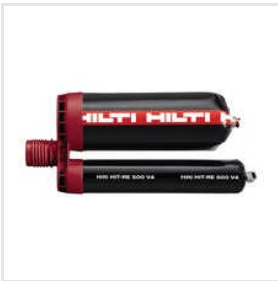
HIT-RE 500 V4 Epoxy Anchor