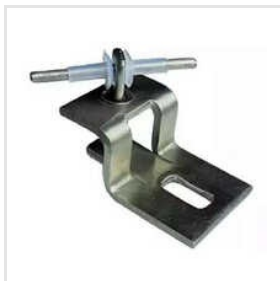
Fischer Chair Clamp Stainless Steel