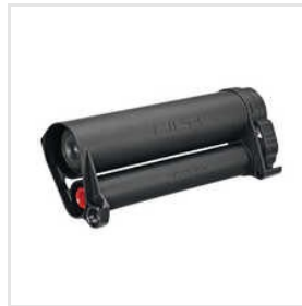
HIT-CB 500 Cartridge Holder