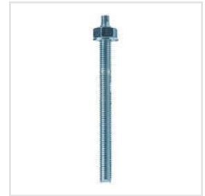
Threaded Rod FTR