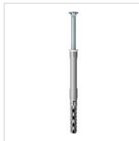
Frame Fixing SXR With Countersunk Head