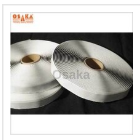
Roofing Tape RT45