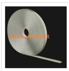
Butyl Sealant Strip Tape