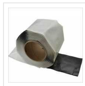
Black Mastic Tape