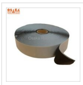
Mastic Sealing Tape