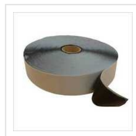
Brown Mastic Tape