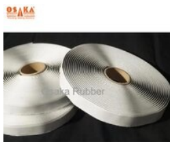
BUTYL RUBBER SEALANT TAPE

Architectural Building Rubber Profiles, Architectural Rubber Profiles, Bituminous Flashing Tape, Bituminous Membrane, Bituminous Roofing Membrane, Bituminous Sealing Tape, Black Extruded Rubber Profile, Black Mastic Tape, Brown Mastic Tape, Brown Tacky Tapes, Bus Body Rubber Profiles, Butyl Flashing Tape, Butyl Fleece Tape, Butyl Mastic Tape, Butyl Rubber Based Mastic Tapes, etc.