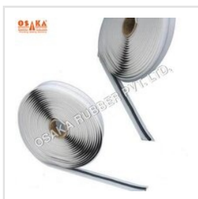
Door Sealant Tapes