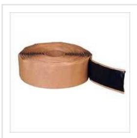
Rubber Mastic Tapes