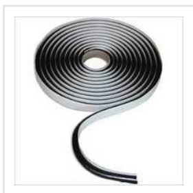
Butyl Rubber Sealants