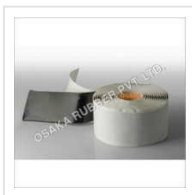
Butyl Mastic Tape