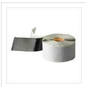
Butyl Rubber Based Mastic Tapes