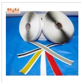
Butyl Sealing Tape