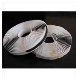
BUTYL SEALANT TAPE