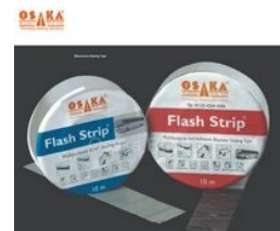
BITUMINOUS SEALING TAPE