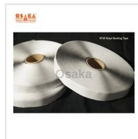
RT45 Butyl Roofing Tape