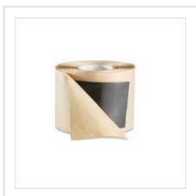
Stress Mastic Tape