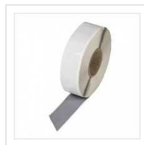
White Butyl Tape