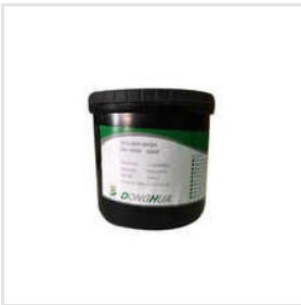
Green UV Solder Mask Ink