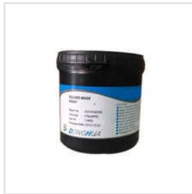
Etching And Plating Ink