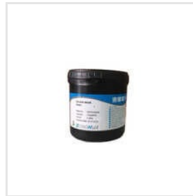
Dh001 Photoimageable Etching Ink Metal