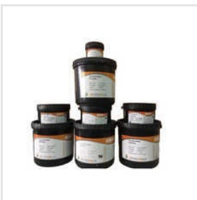
DH 801W Photomagneable