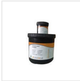
Thermal Curable Marking Ink