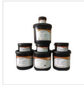
Solder Masking Ink