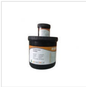
DH 502W Thermal Marking Legend White