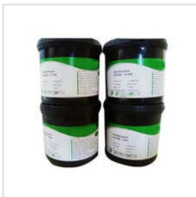
A 2100C UV Curable Alkaline Etching Ink