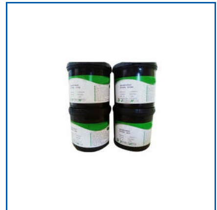
UV CURABLE ALKALINE ETCHING RESIST INK