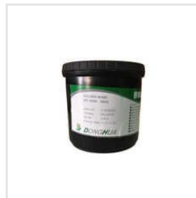
DH 8000G930 UV Solder Mask Green Ink