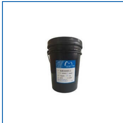
DH 203 THERMAL ETCHING INK