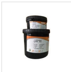
DH 7000 G700 Thermal Solder Mask Green Ink