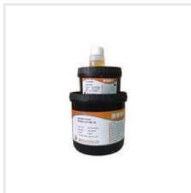
DH9001 LED 368-2B Bluish White Solder