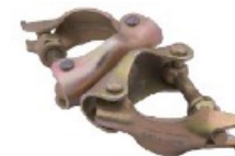
Swivel Coupler Light/Heavy (Sheet Metal)