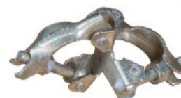
Fixed Coupler Light/Heavy (Sheet Metal)