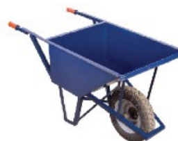
Harbana (Single tyre) 2.5 CFT.