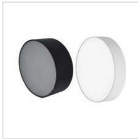
18w Round White And Black Surface Panel