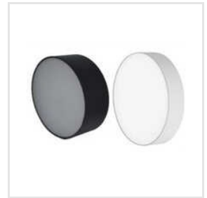
15W Round White And Black Surface Panel