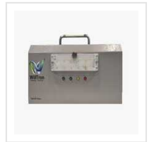
Nano Solar Inverter