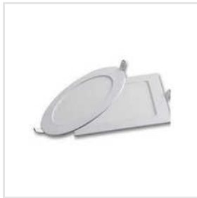
15W Slim Conceal Panel