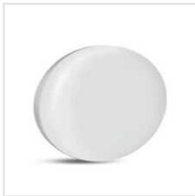
8W Round Moon Light