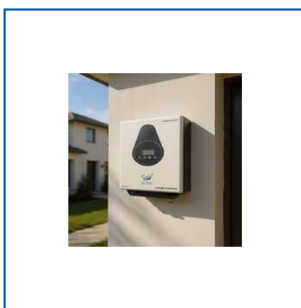
MODEL 2.5KVA MICRO INVERTER SERIES