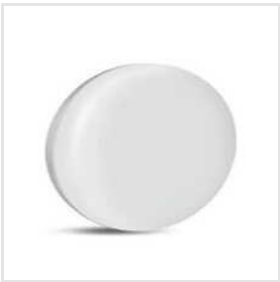
24w Round Moon Light