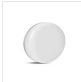
22W Panel Surface Panel