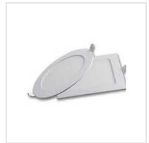
3W Slim Conceal Panel