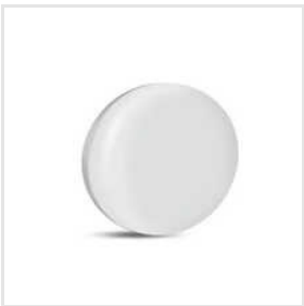
15W Panel Surface Panel