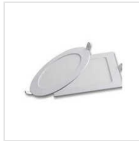
22W Slim Conceal Panel