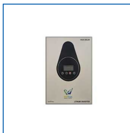
MICRO INVERTER WITH LITHIUM INBUILT BATTERY