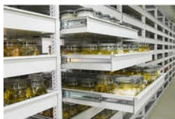
DRAWER TYPE STORAGE SYSTEM

Compactors With Carates, Drawer Type Storage System, Heavy Duty Pallet Racking System, Industrial Manual Compactors, Industrial Rack Supported Warehouse, Manual Compactors, Vertical Carousels, etc.