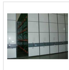
Industrial Manual Compactors