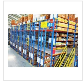
Industrial Rack Supported Warehouse