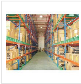
Heavy Duty Pallet Racking System