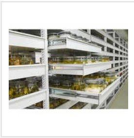
Drawer Type Storage System